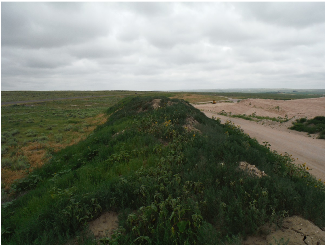
Stockpile of topsoil or overburden along northern boundary; looking east.