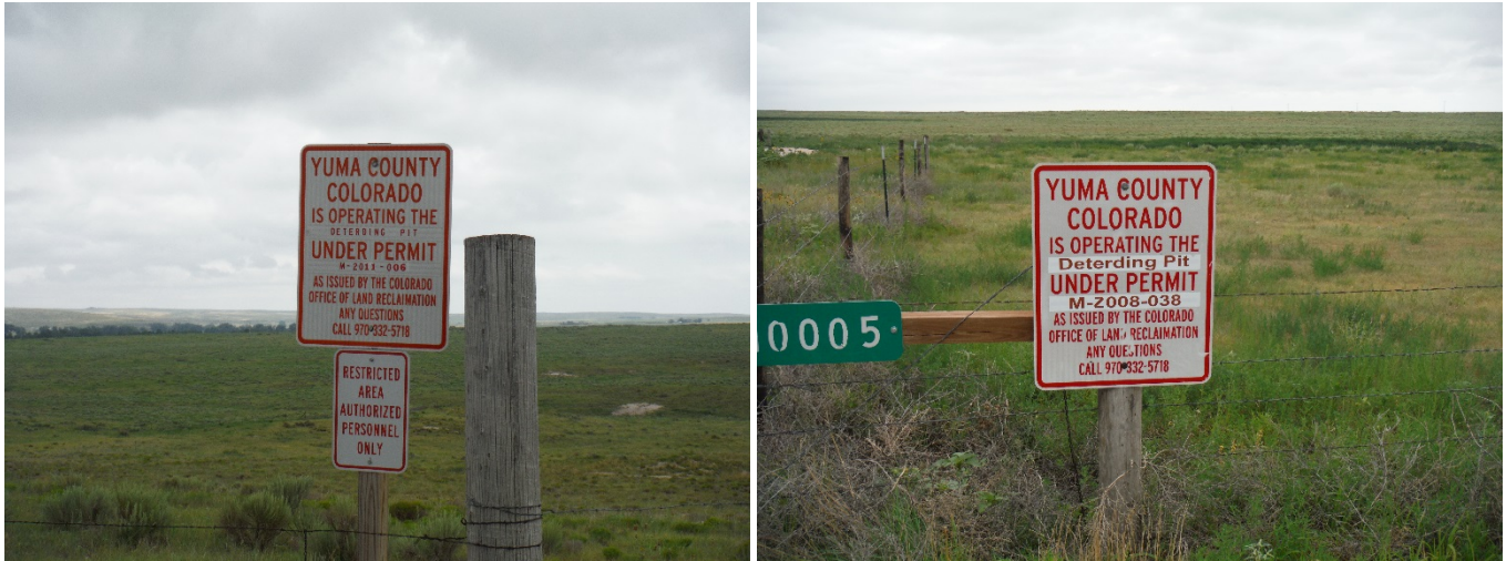
Permit identification signs at each entrance, western (right picture) has incorrect permit number; looking south.