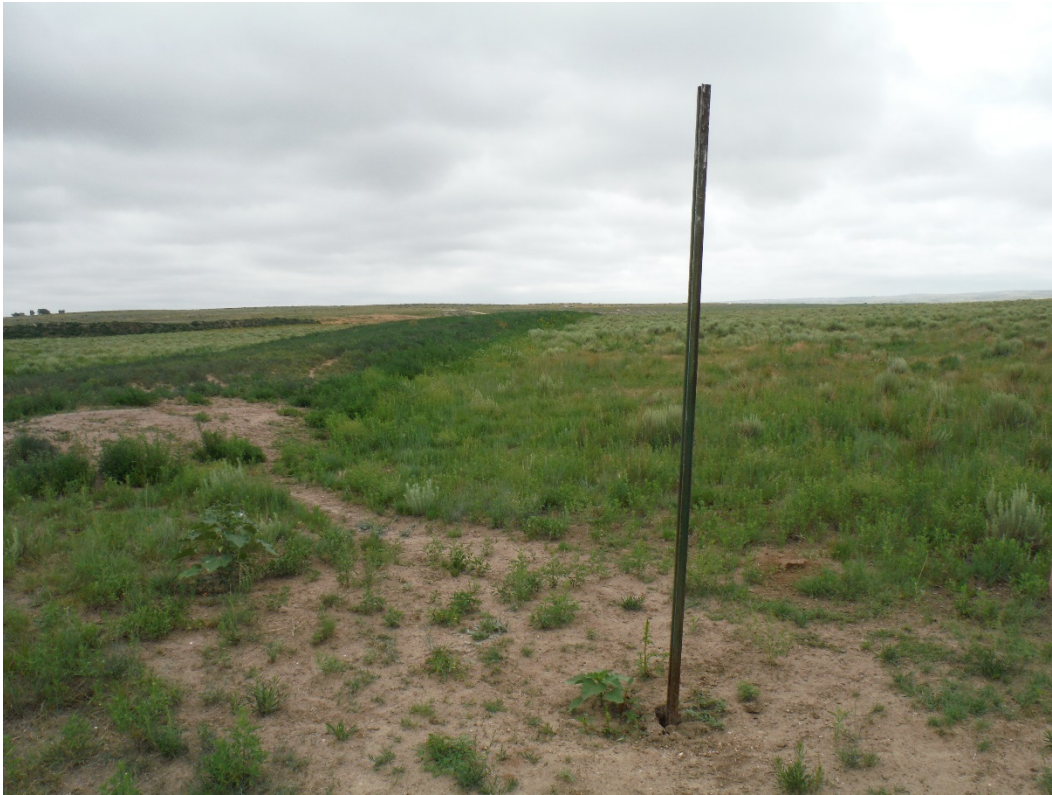
Southwest boundary marker, topsoil stockpile on the inside; looking east.