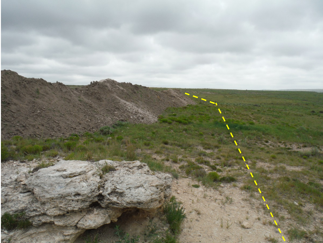
Topsoil being pushed up the southern permit boundary (approximated by the dashed yellow line); looking east.