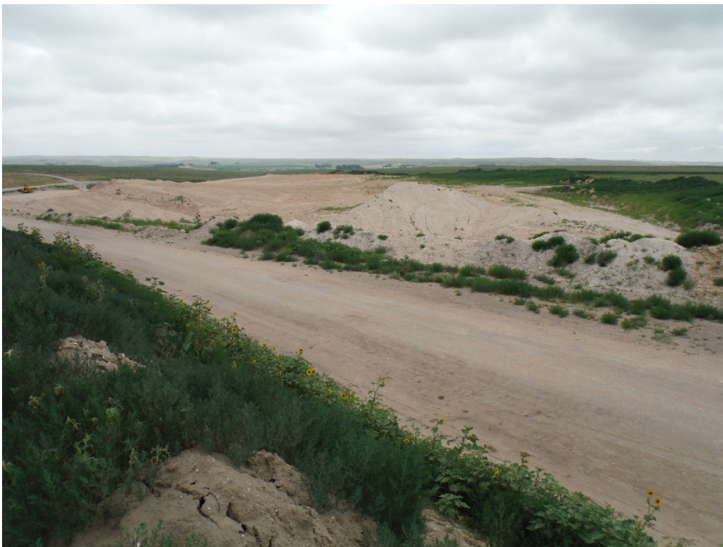
Overview of the active area; looking southeast.