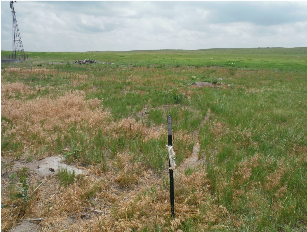
Permit boundary marker located on the curve around the windmill, permit is 200' around the structure; looking south.

Don Marr Yuma County 1310 S. Blake St. Wray, CO 80758