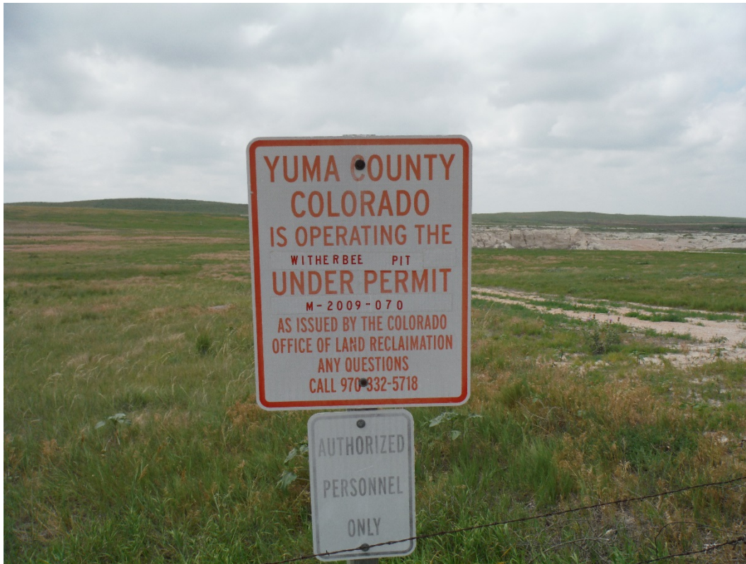
Permit identification sign at the site's entrance; looking west.