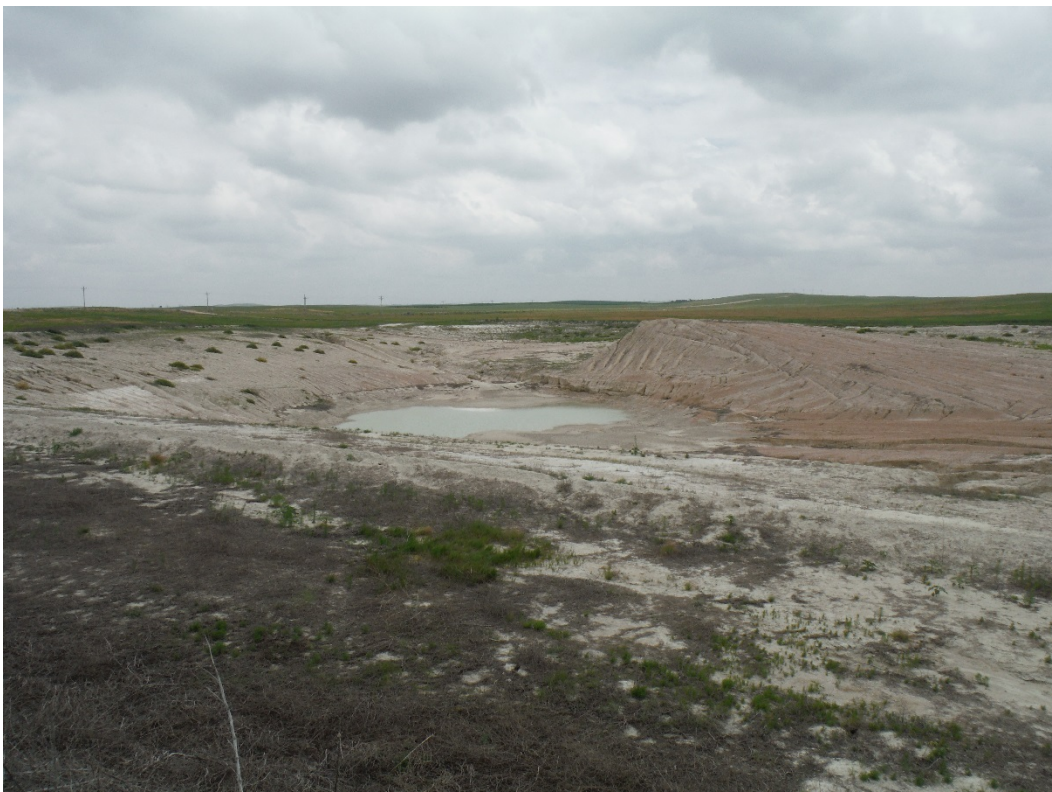
Overview of the pit; looking southeast.