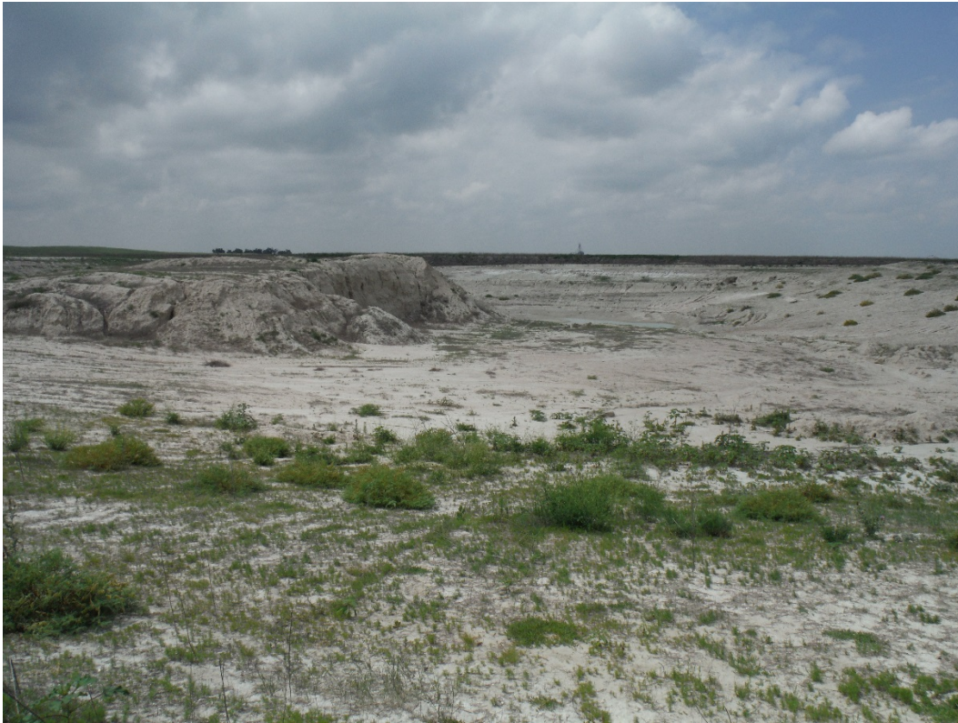
Overview of the pit; looking northwest.