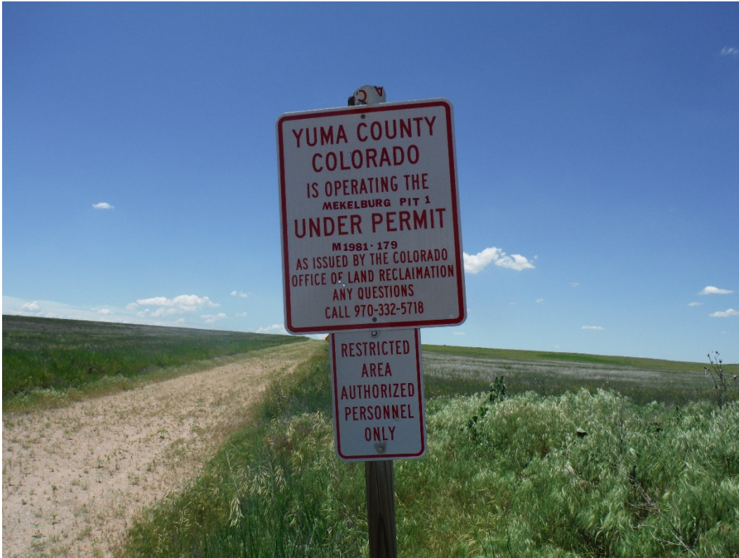
Permit identification sign at the entrance of the access road; looking west.