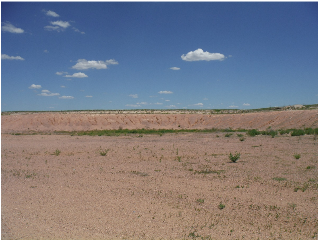
Active, western pit overview; looking east.