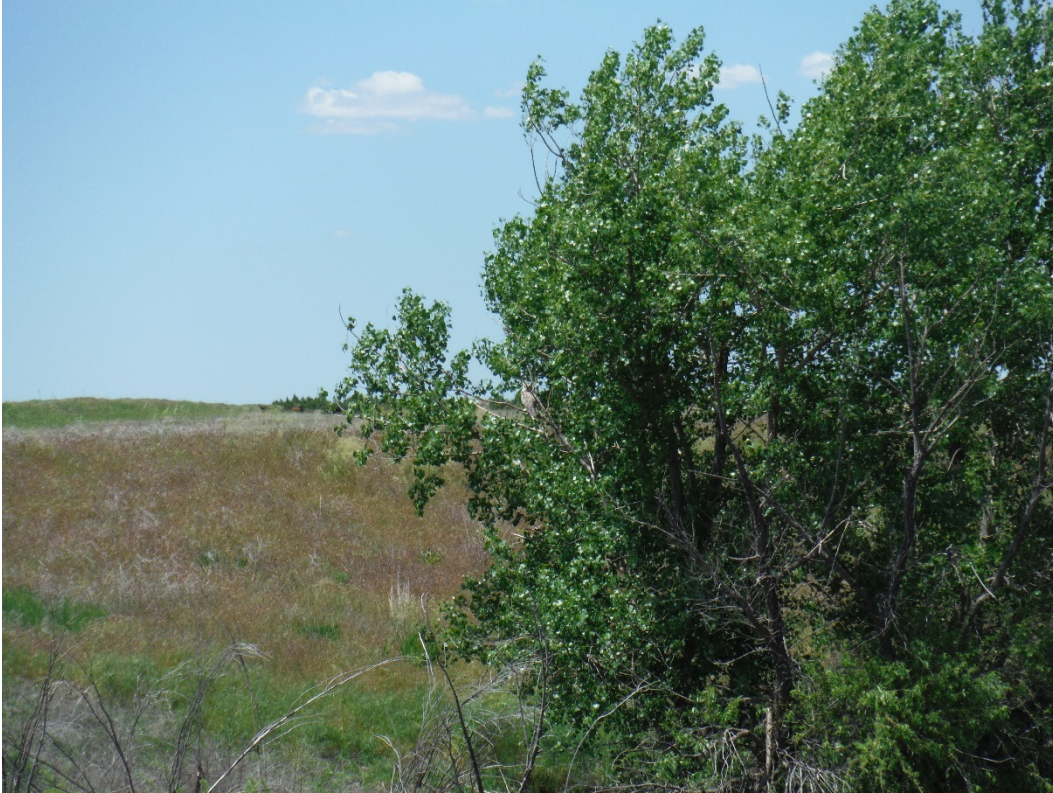
Great horned owl in a tree near the western permit boundary; looking northwest.

Don Marr Yuma County 1310 S. Blake St. Wray, CO 80758