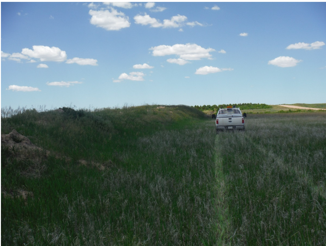
Topsoil stockpiled along eastern boundary; looking north.