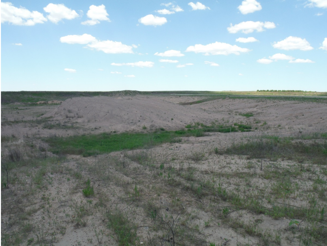
Older, eastern pit overview; looking northwest.