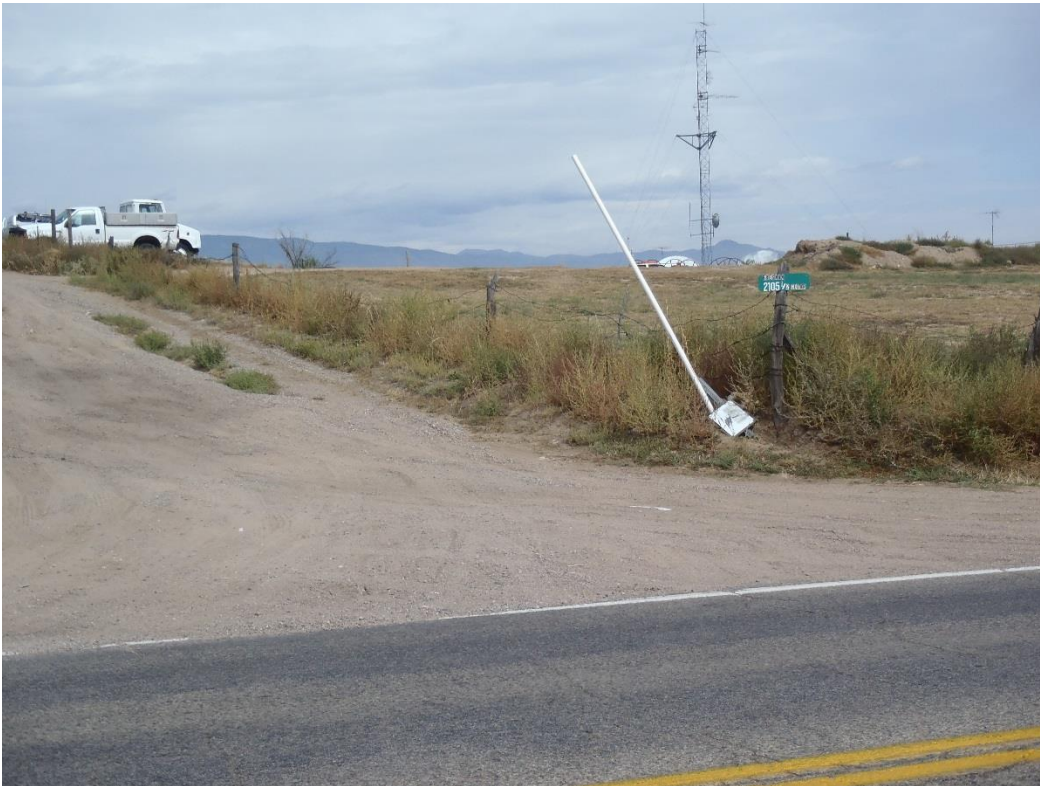
Photo 4. Affected area boundary fencing in south center area (south side looking north).