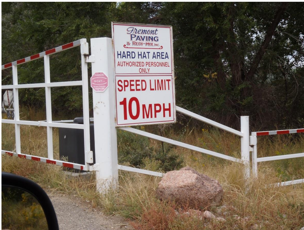
Photo 1. MacKenzie Ave. site entrance without Permit identification sign.

Please contact Tim Cazier (303-866-3567, ext. 8169) if you have any questions regarding this report.