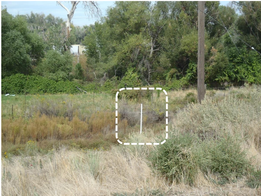
Photo 3. T-post affected area boundary marker on west side of the pit (west side looking NW).