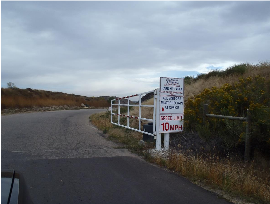
Photo 2. Hwy 115 site entrance without Permit identification sign.