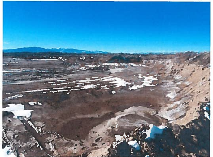
Current Disturbance ~9 acres