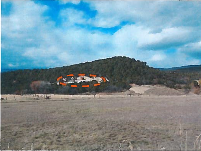
Disturbed Area in Orange Dashed