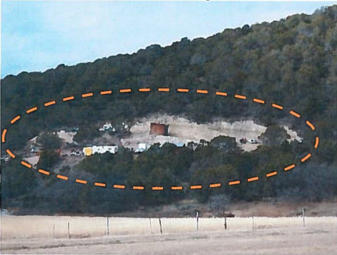
Area used for storage