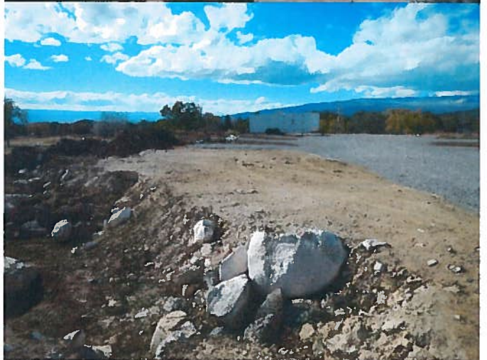
Material used for fill at Aspen Trails Campground