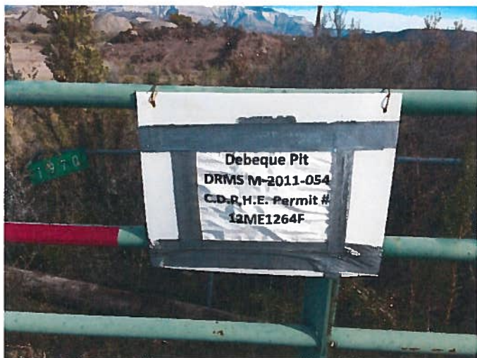
Mine Identification Sign