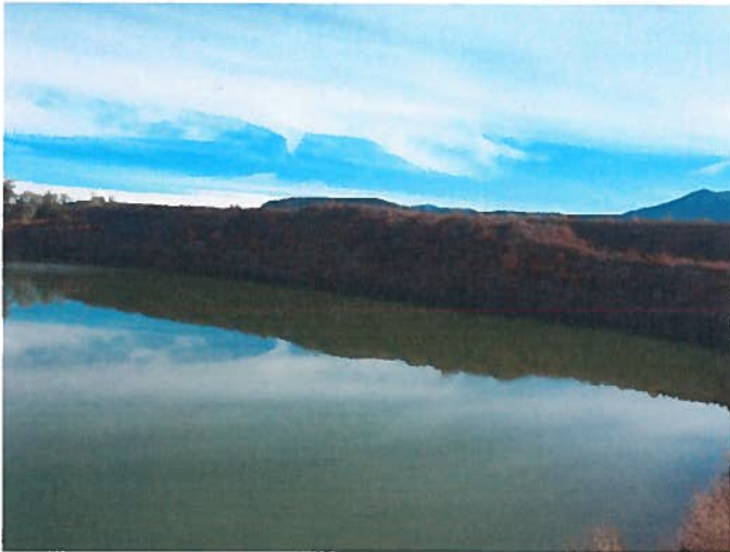
Pond with too steep of slopes – 3:1 required