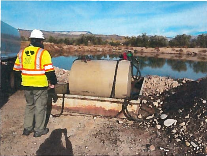
Fuel Tank with adequate secondary containment