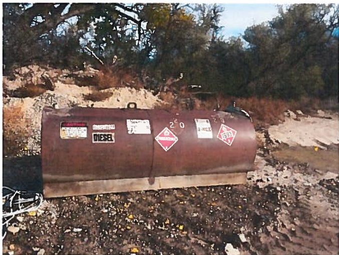
Empty Fuel Tank