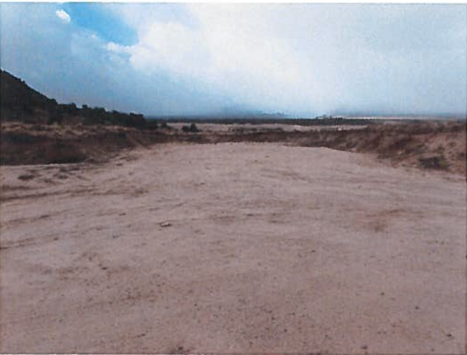
Figure 3: View towards the west end of the pit