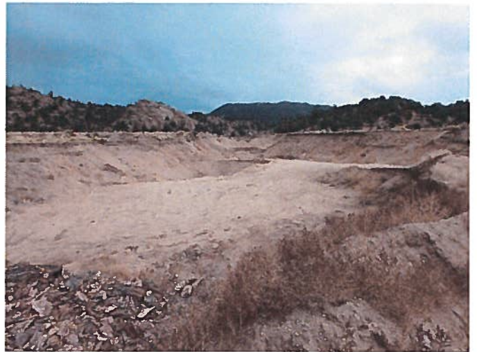
Figure 2: View towards the east end of the pit