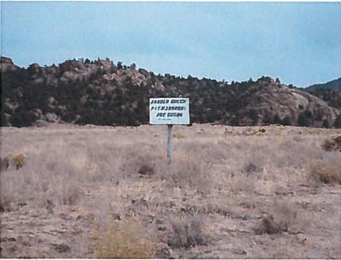
Figure 1: Mine site entrance