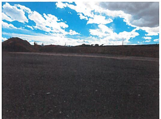
Figure 6: South part of the north pit area