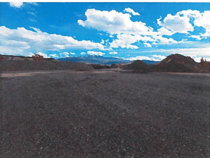
Figure 5: South part of the north pit area