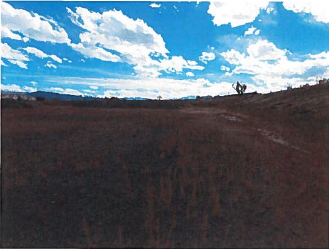
Figure 7: South pit area