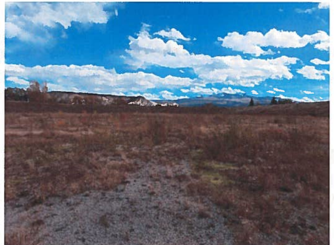
Figure 10: Tamarisk infestation developing in southernmost part of the south pit.