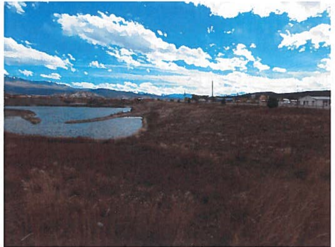
Figure 2: West slope of the north pit viewed from the north