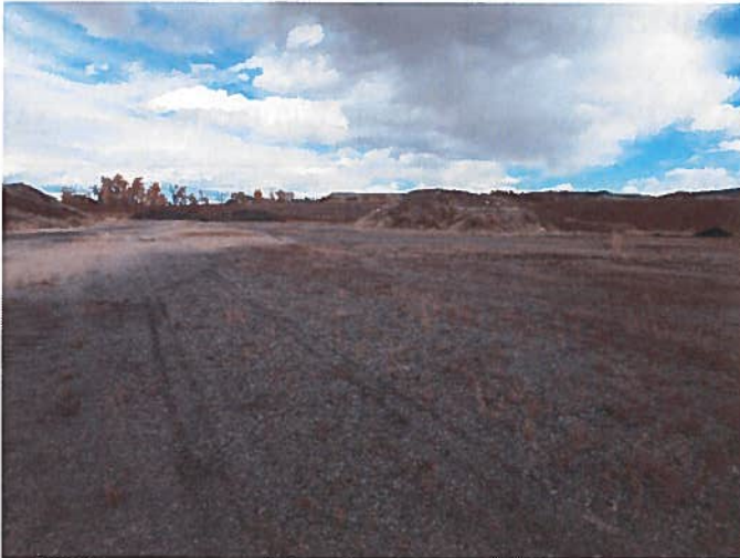
Figure 9: South pit area