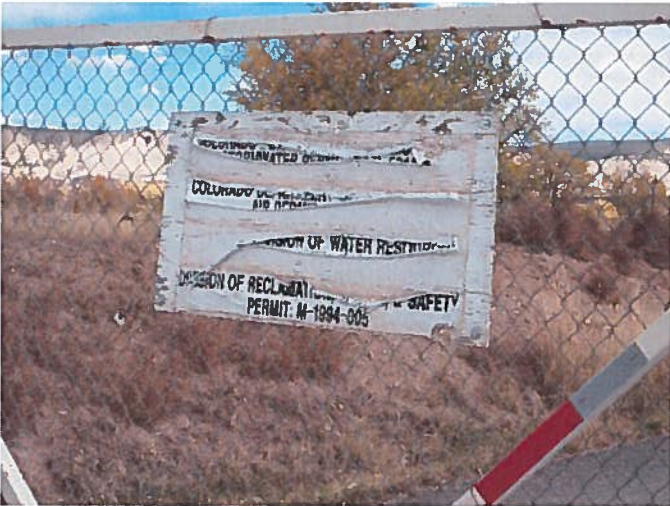
Figure 1: Inadequate sign at mine entrance