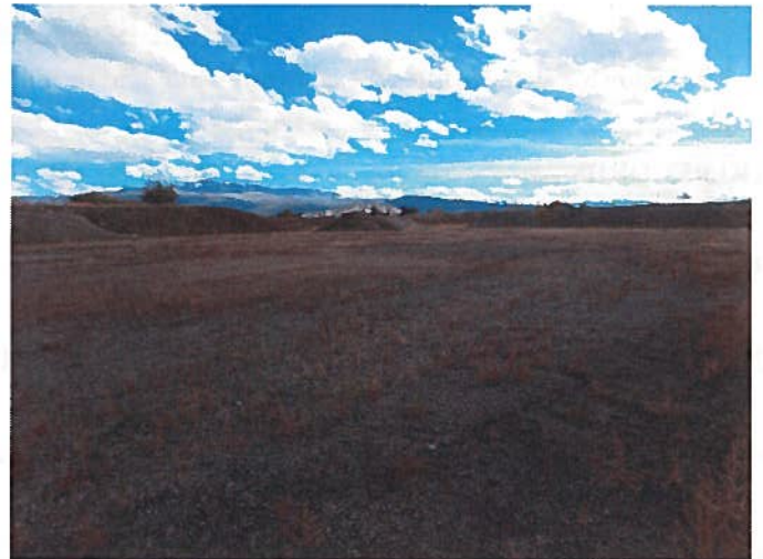
Figure 8: South pit area