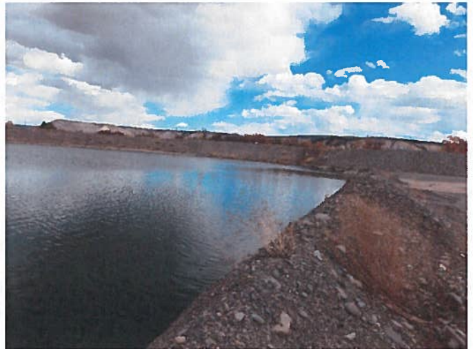
Figure 4: Looking toward the east slope of the north pit from the south side of the lake