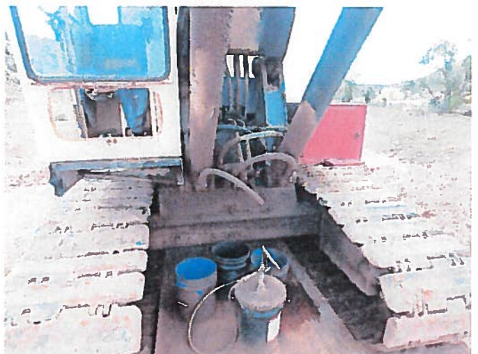
Figure 6: Old excavator on site