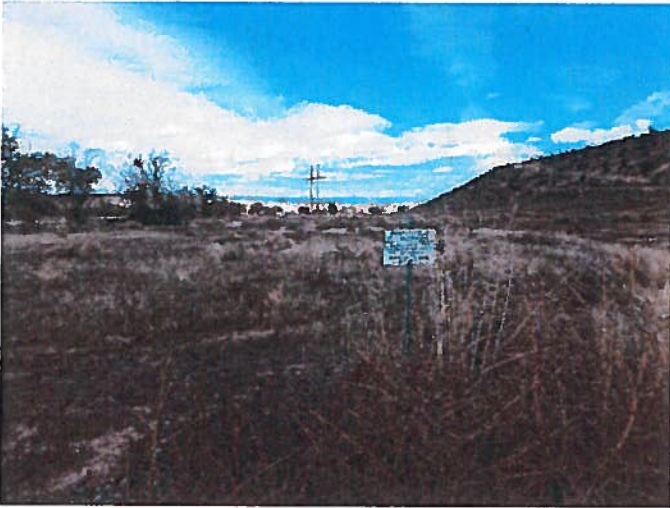
Figure 1: Adequate mine sign at entrance