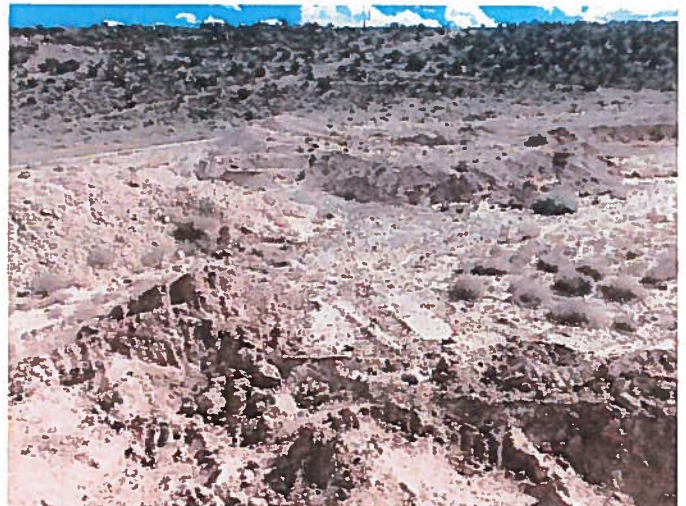
Figure 4: North pit slope and dirt piles