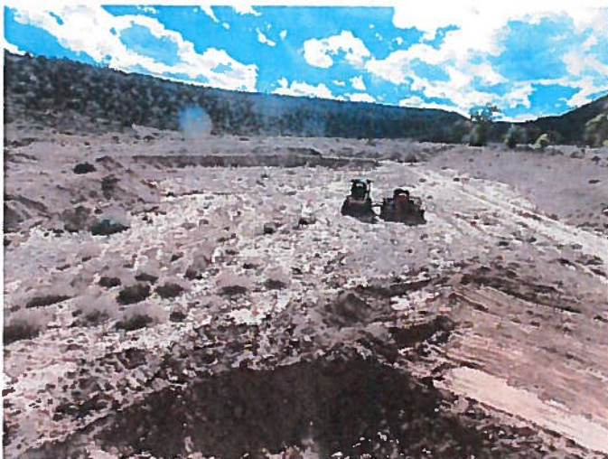
Figure 5: Pit area viewed from north end