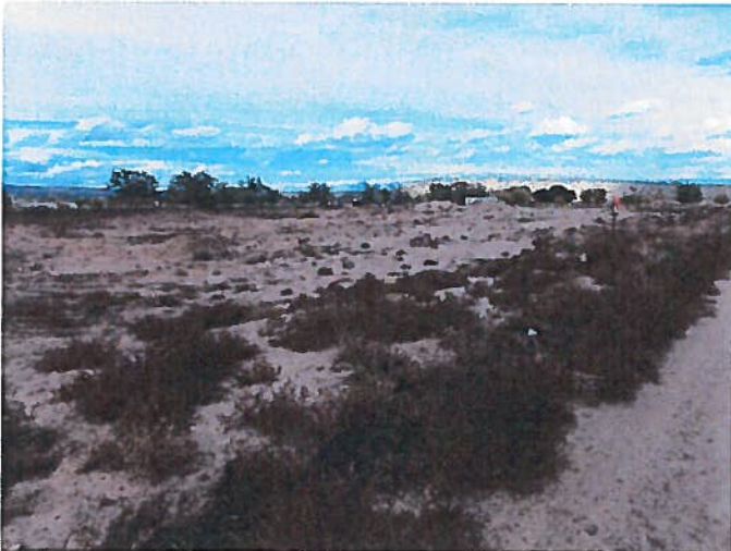
Figure 3: Pit area