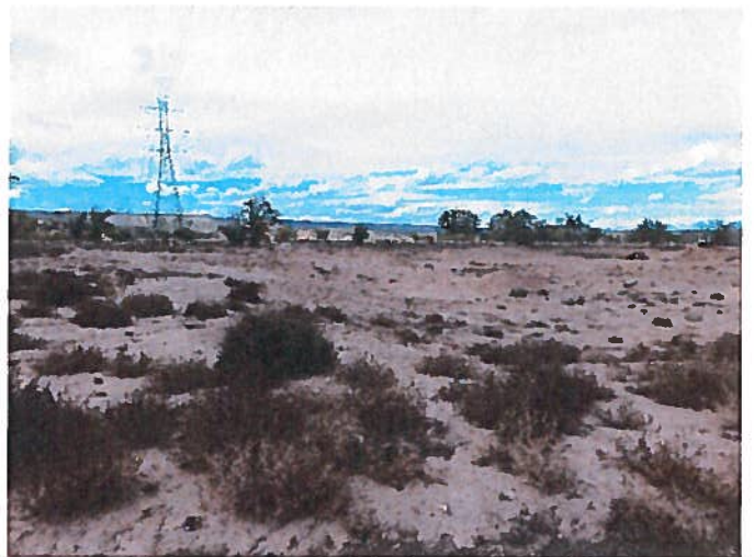
Figure 2: Pit area