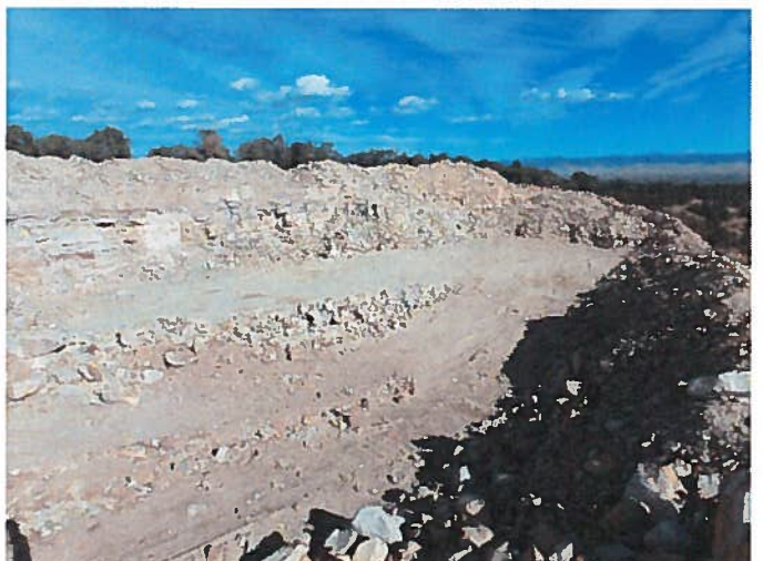
Figure 6: Active pit area