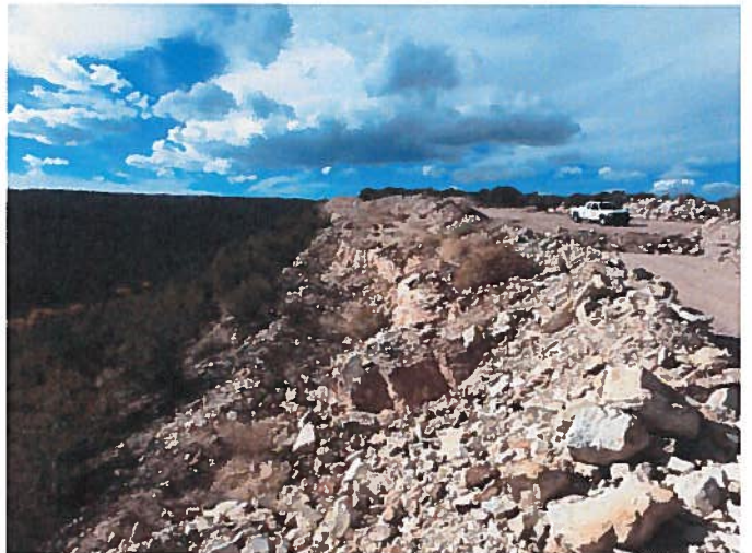
Figure 4: Berm placed along south side of stripped area