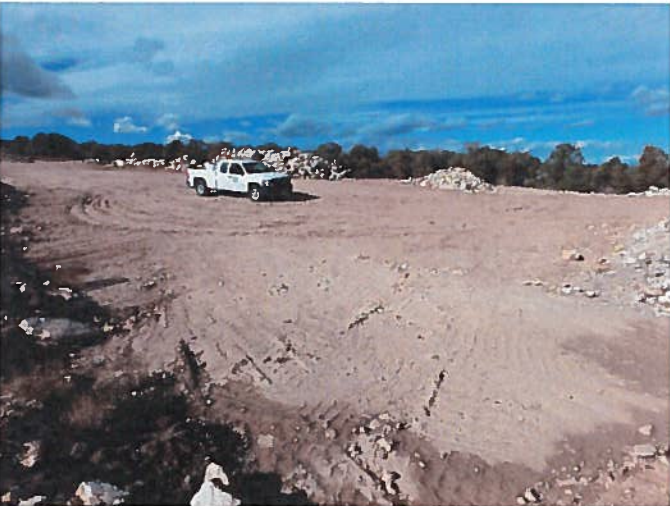
Figure 3: North part of stripped area