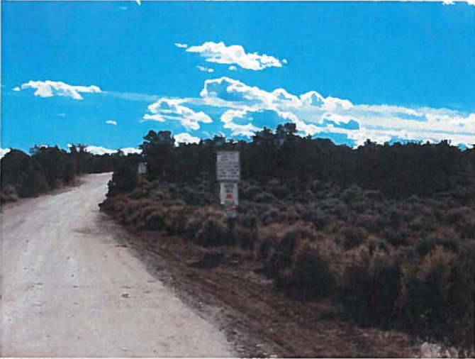
Figure 1: Adequate mine identification sign