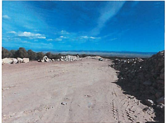
Figure 2: Stripped area viewed from southwest end