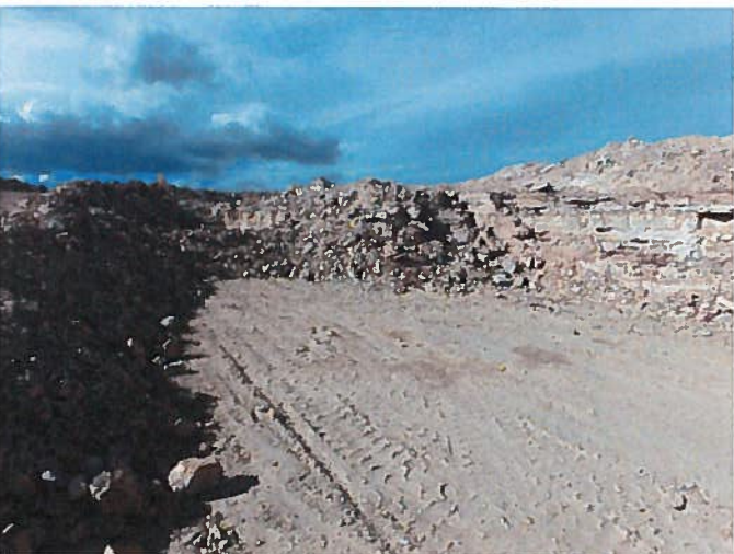
Figure 5: Active pit area