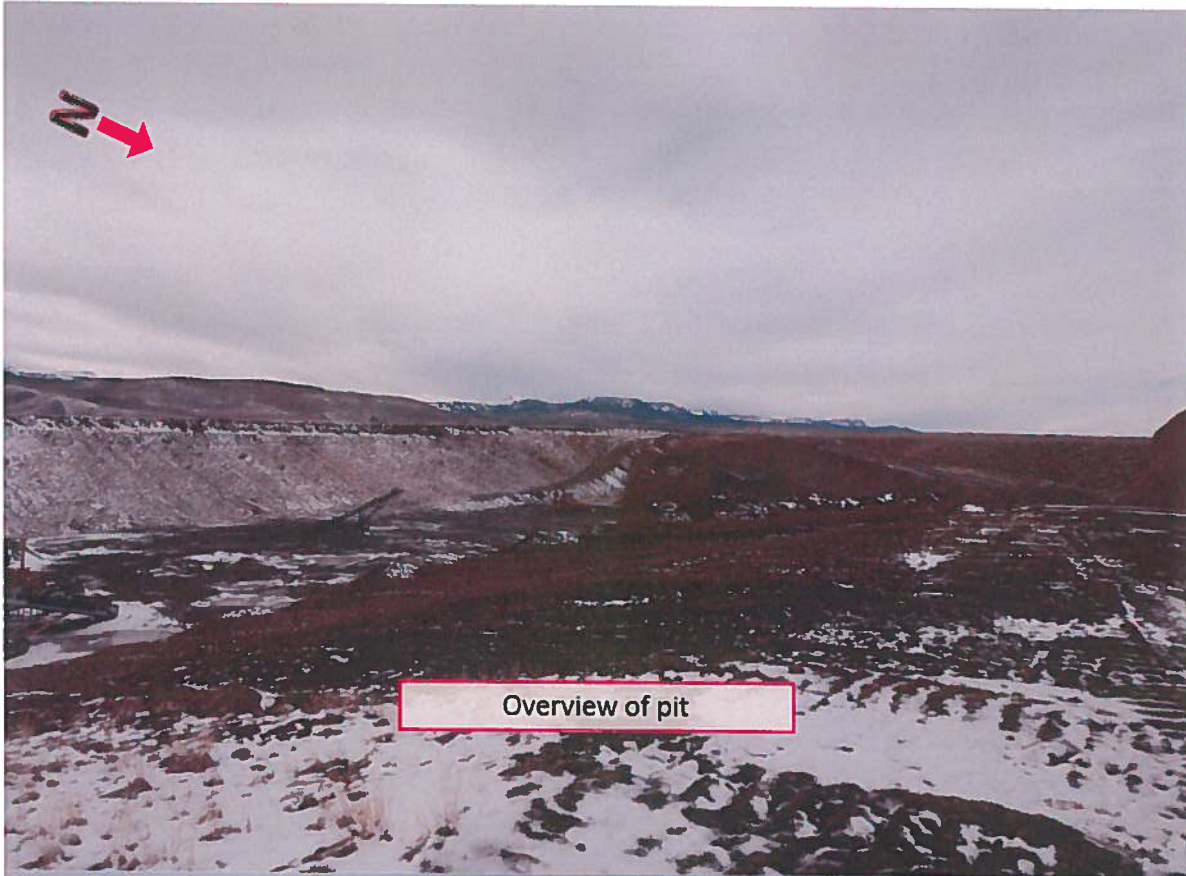
Overview of pit