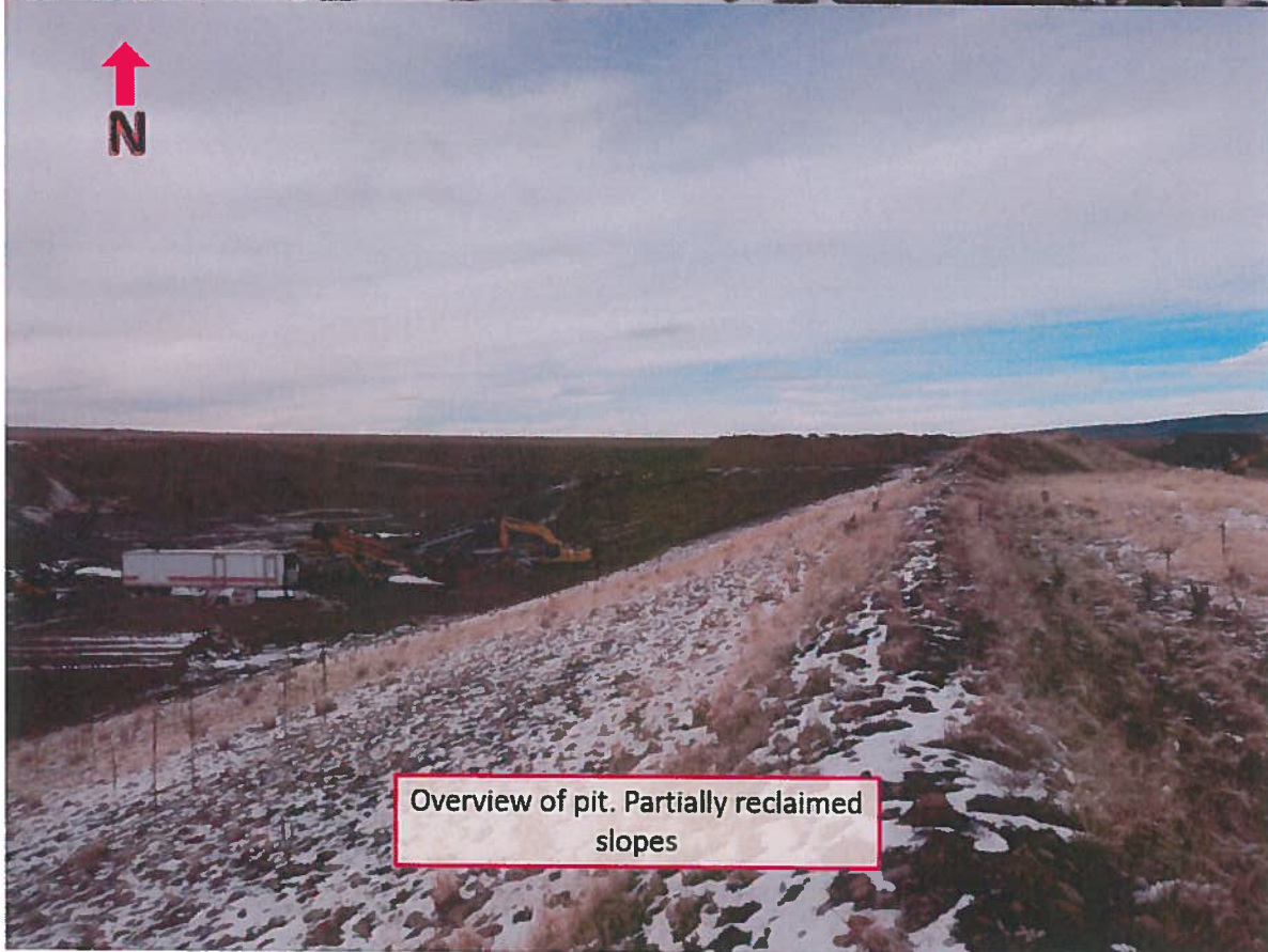
Overview of pit. Partially reclaimed slopes