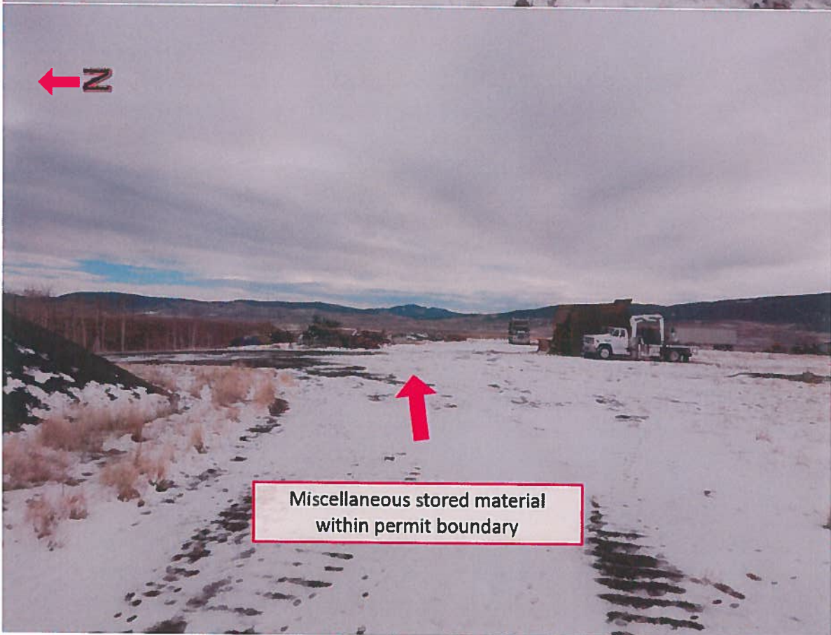
Miscellaneous stored material within permit boundary