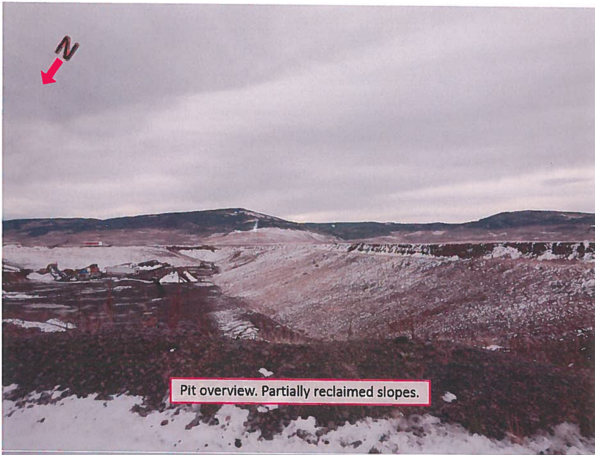
Pit overview. Partially reclaimed slopes.