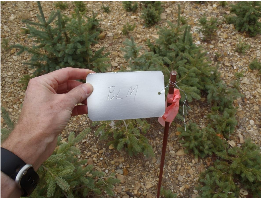
Photo 4. Typical southeast corner area marker with BLM tag.