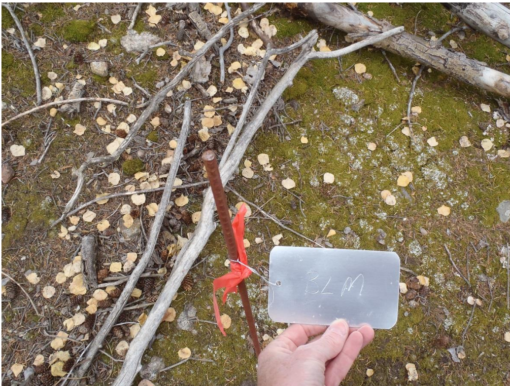
Photo 3. Typical west side area marker with BLM tag.