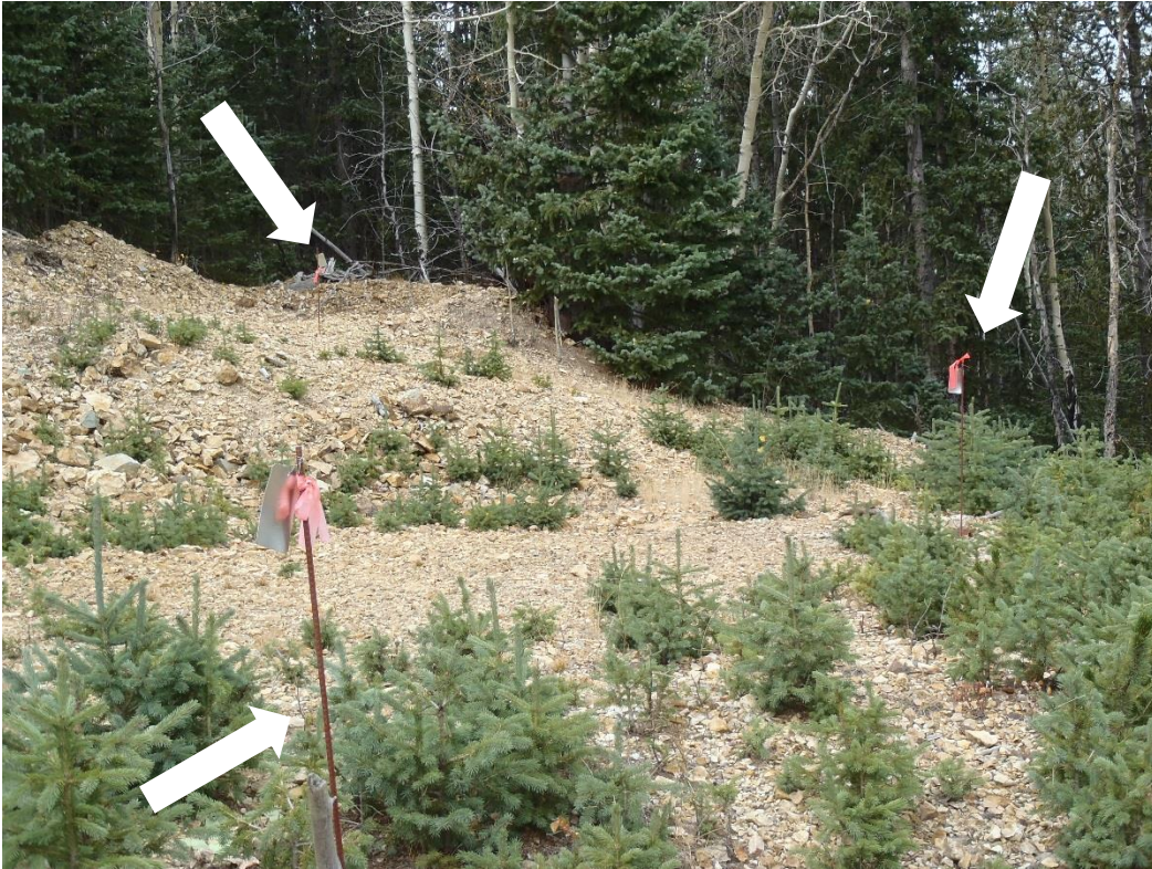
Photo 2. Southeast corner BLM area to be released (Note: 3 rebar markers & conifer growth).