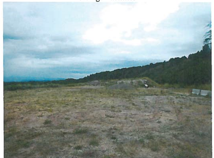
Bench where portal is located