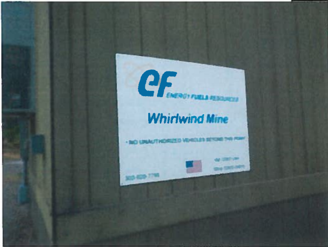
Mine Identification Sign