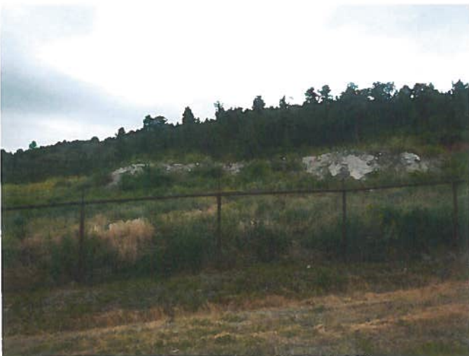
Waste Rock Pile beyond Fence