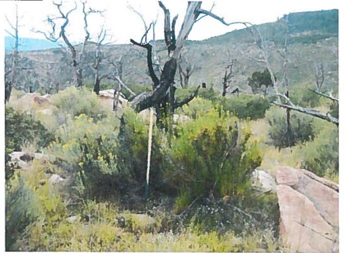
Permit Boundary Marker