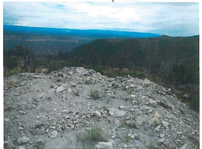
Top of Ore Pile