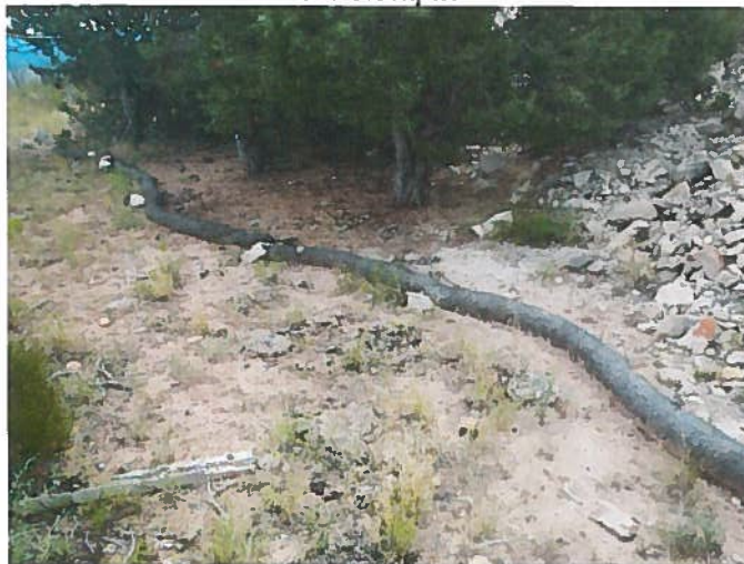
Straw wattle surface water protection