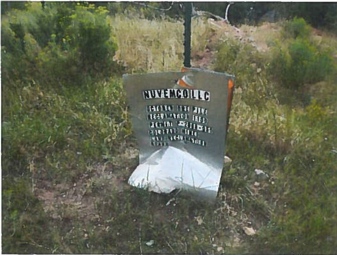
Mine Site ID sign