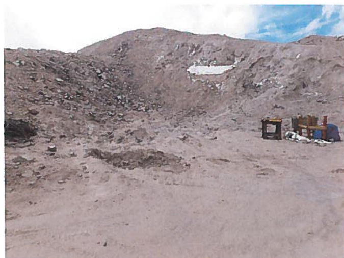
Figure 3: Dig/screening area