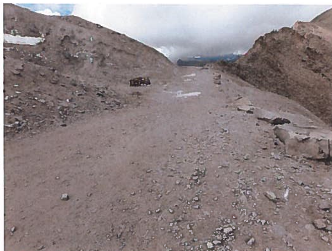
Figure 2: Dig/screening area