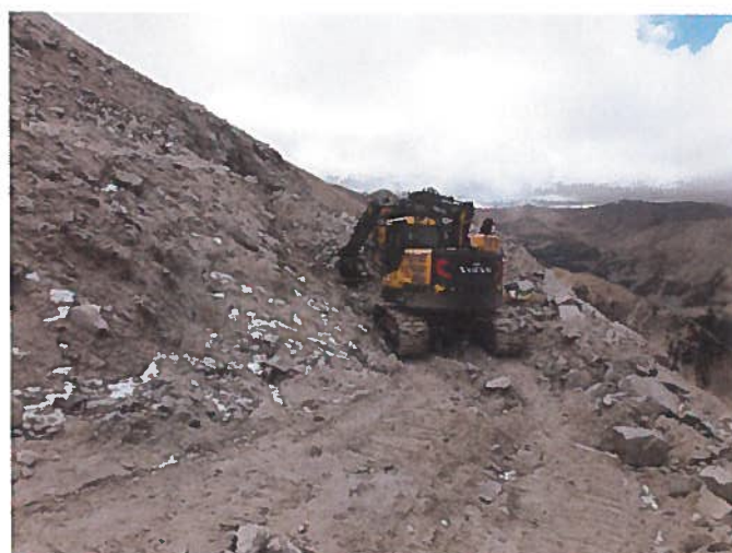
Figure 4: Current dig area