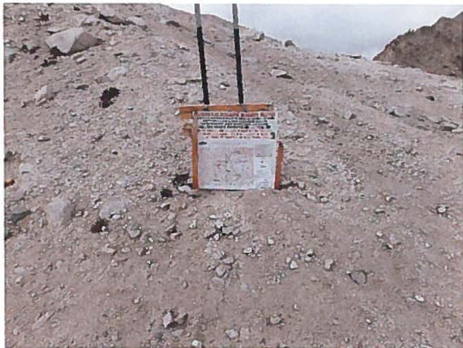
Figure 1: Inadequate mine ID sign