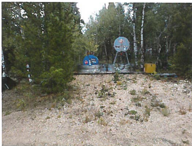
Figure 5: Shop area