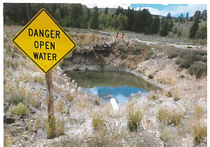
Figure 6: Upper pond, on south side of road