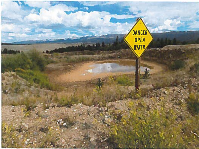
Figure 7: Pond on north side of road