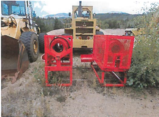
Figure 3: Shop area