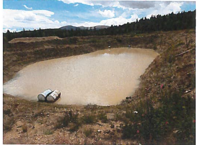
Figure 14: Process area