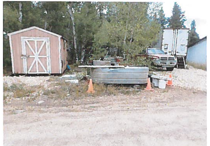
Figure 4: Shop area