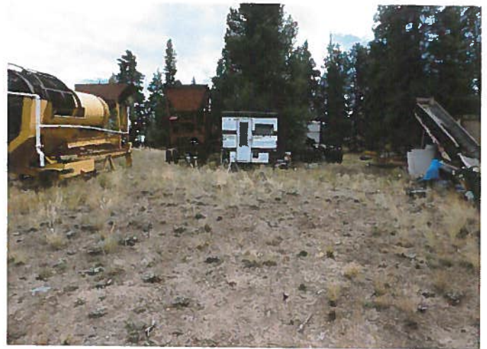
Figure 20: Wooded "junk" area