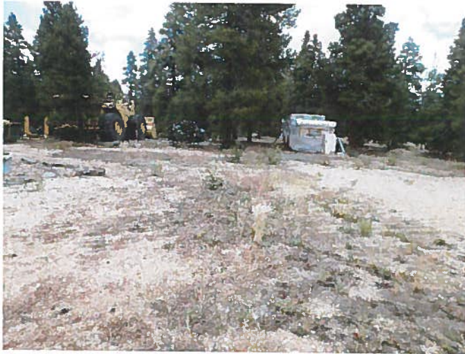
Figure 21: Wooded "junk" area