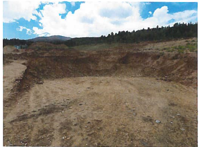
Figure 16: Dig area north of process area