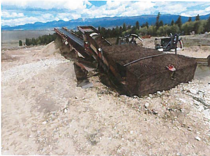
Figure 13: Process area