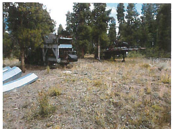
Figure 18: Wooded "junk" area