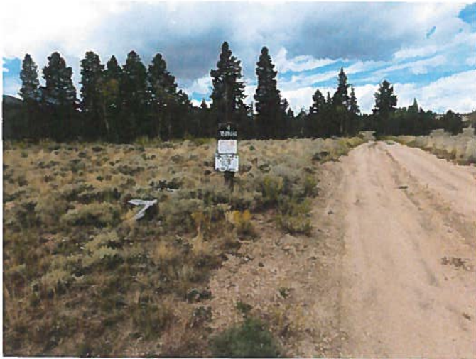
Figure 1: Mine entrance