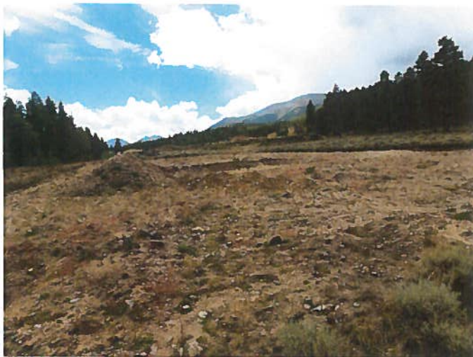
Figure 17: North 1/2 acre area stripped of stockpile