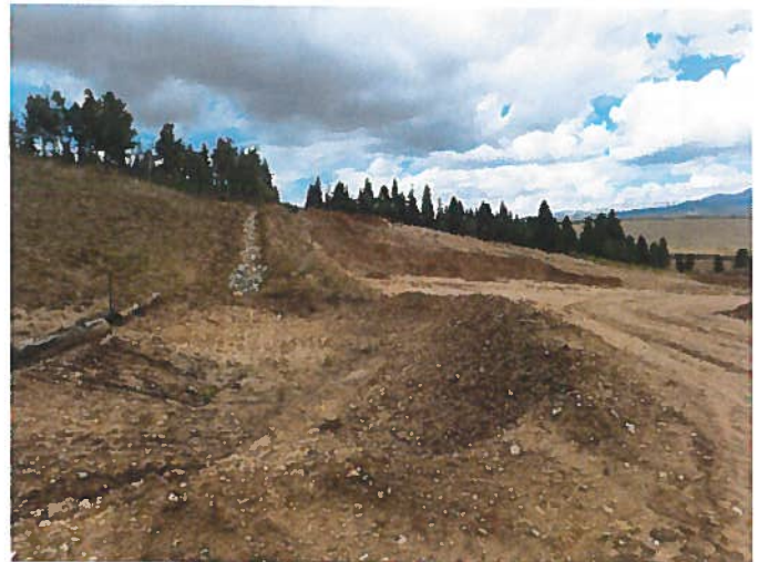
Figure 10: North retention pond at base of USFS slope