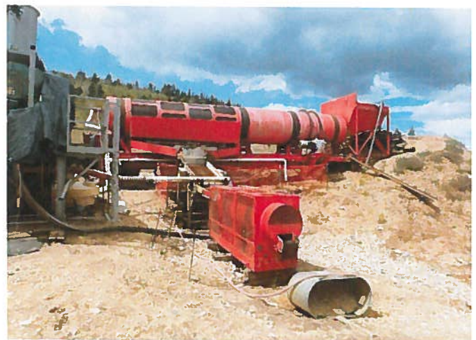
Figure 12: Process area