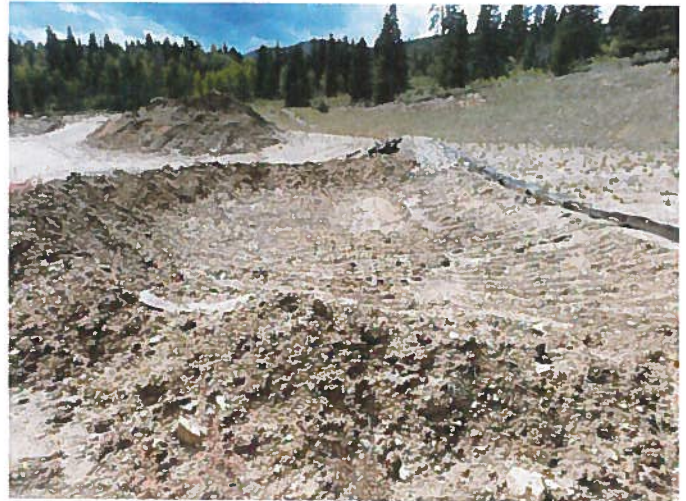
Figure 8: South retention pond at base of USFS slope