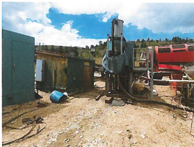
Figure 11: Process area