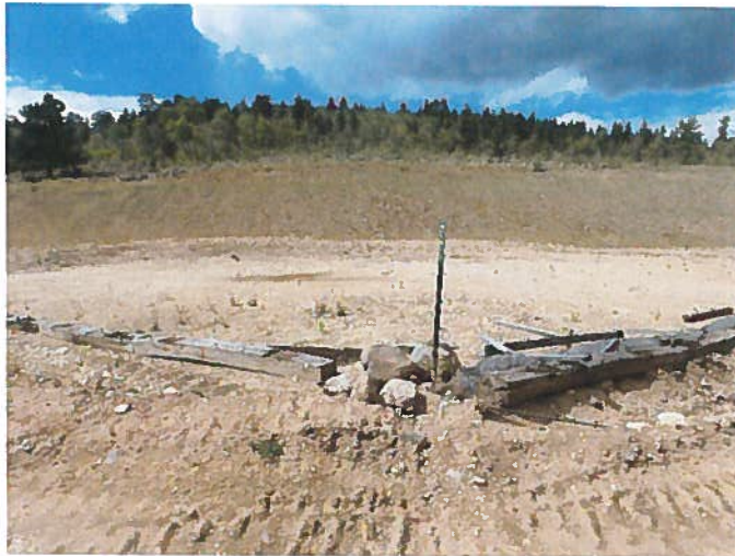
Figure 9: Reclaimed USFS slope