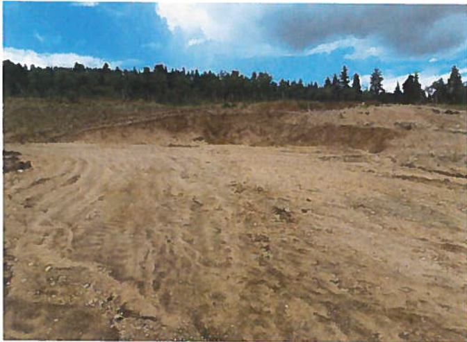
Figure 15: Redisturbed slope on north side of USFS slope