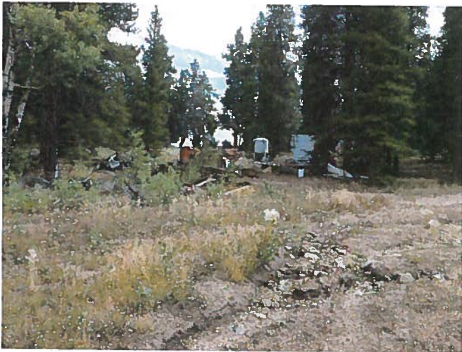
Figure 19: Wooded "junk" area