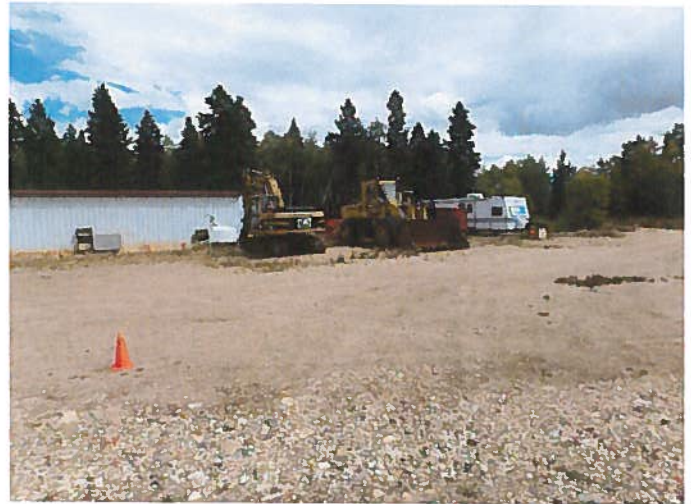
Figure 2: Shop area