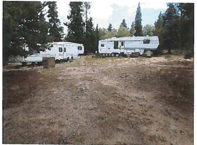
Figure 22: Wooded "junk" area