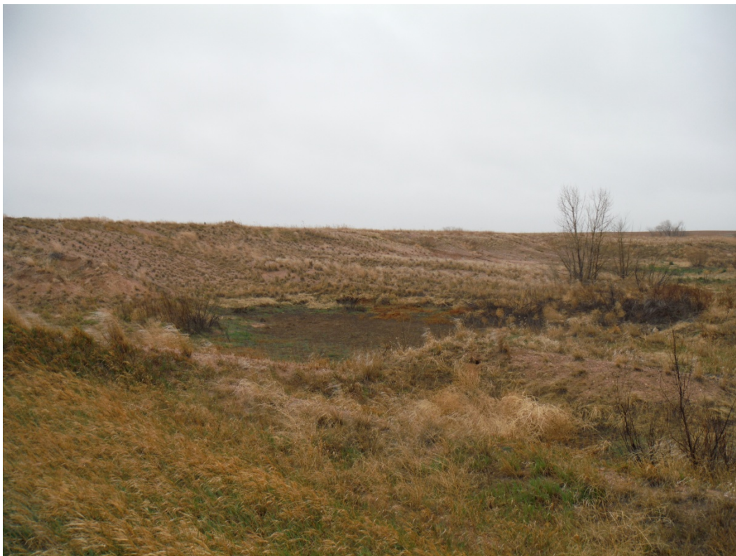
Site overview; looking northwest.