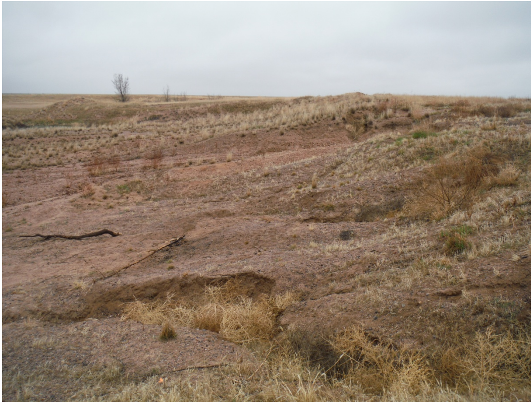
Excavated area, signs of erosion present; looking south.