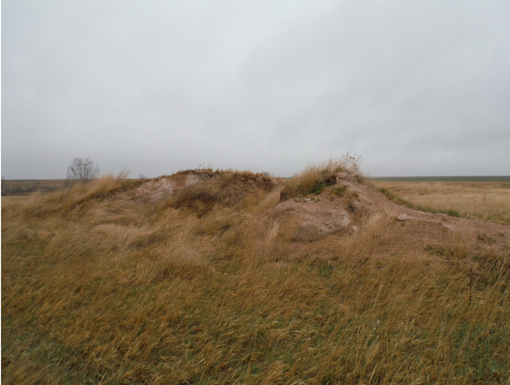
Product stockpile; looking east.