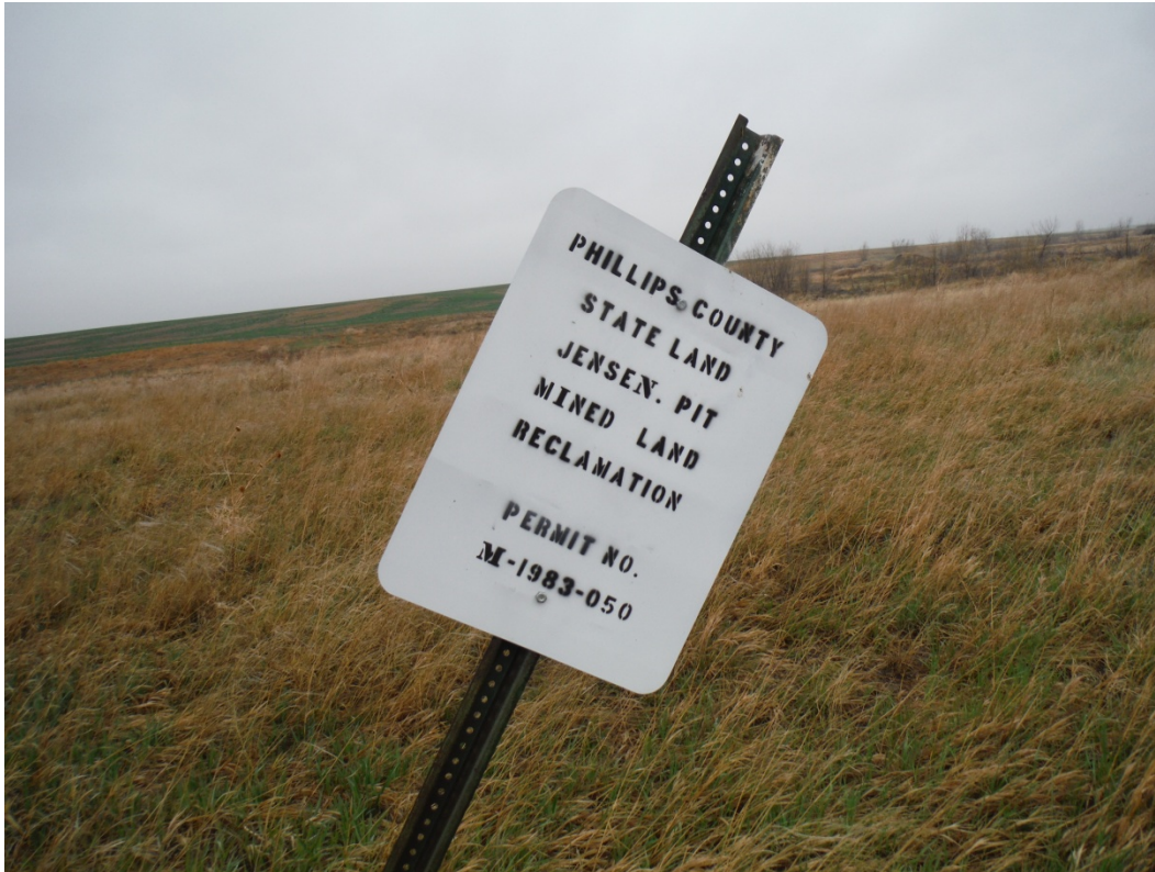
Site identification sign posted at the site entrance; looking east.