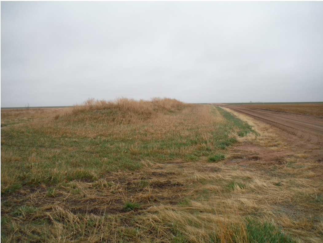
Toposil stockpile along the western boundary; looking south.