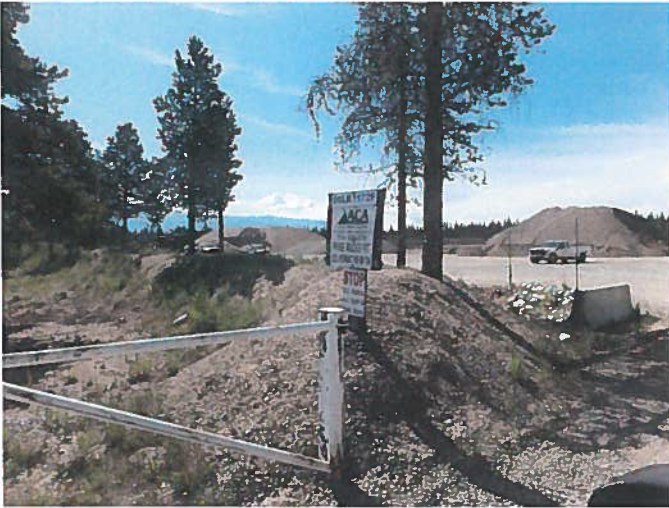
Figure 1: Adequate sign at mine entrance