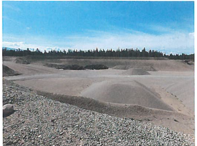
Figure 2: View from north side of pit toward southeast highwall where slope reduction is occurring.