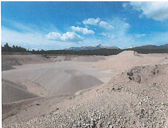
Figure 3: View from northeast side of pit facing south