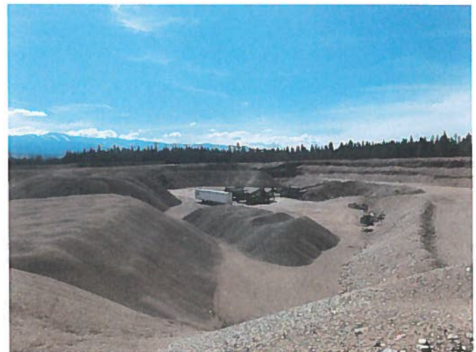
Figure 4: View of active mining area from northwest side of pit