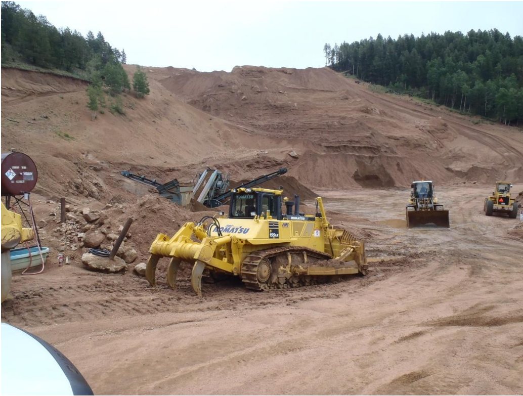
Photo 3. Pit highwall – note rock outcrop in center (looking east).

Greg Loop PK Enterprises, Inc. 11115 W. Hwy. 24, Unit 2A Divide, CO 80814