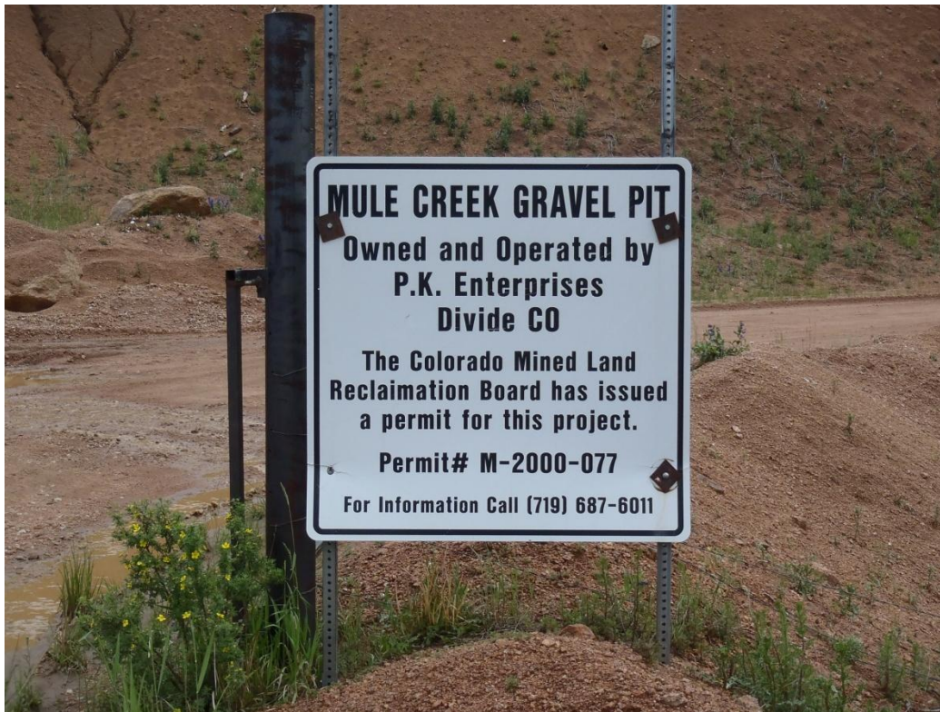
Photo 1. Permit identification sign.