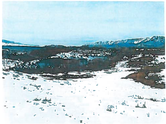
Looking west from top bench