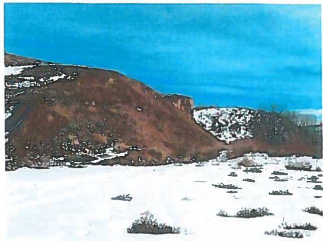
Borrow area looking east with Kochia