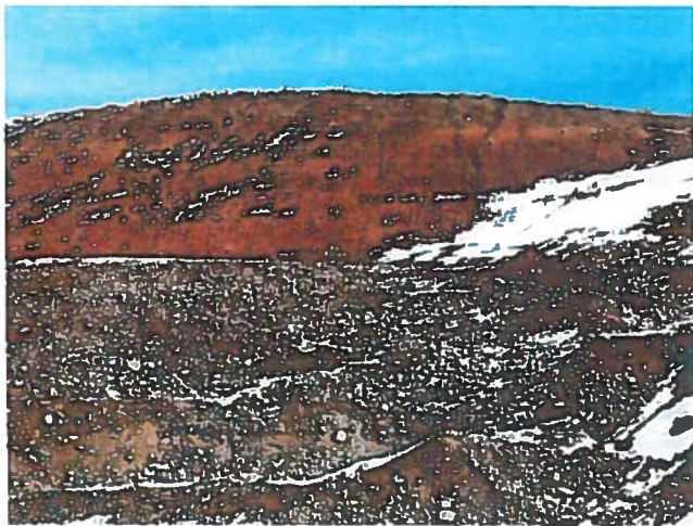
Closeup of rilling and gullies forming