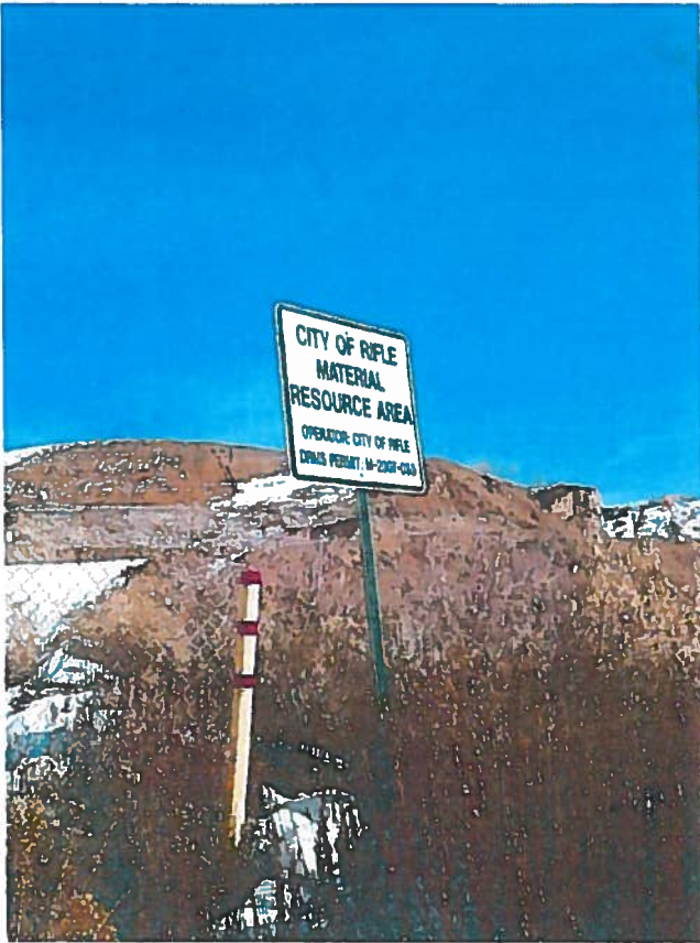
Mine Identification Sign