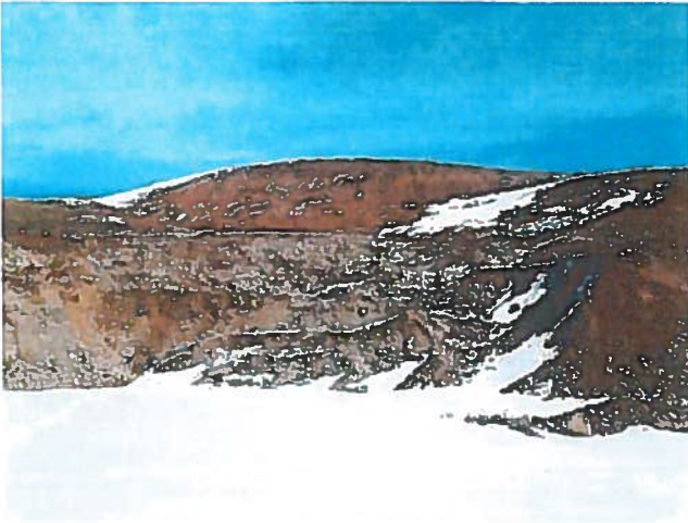
Borrow Area with graded slope above