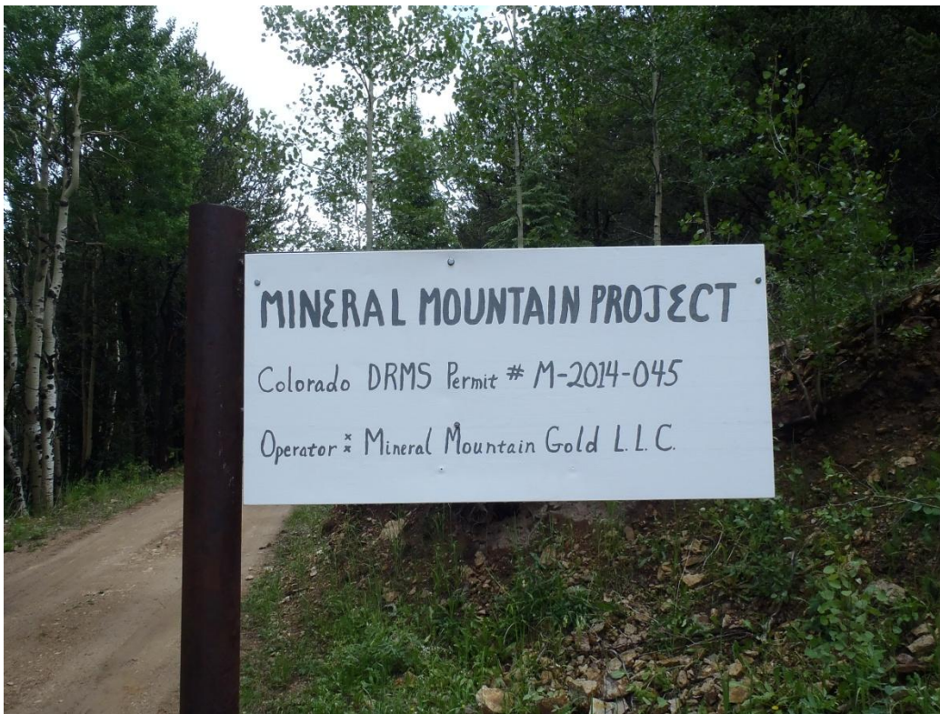
Photo 1. Permit sign displayed on right side of the access road at the site entrance.