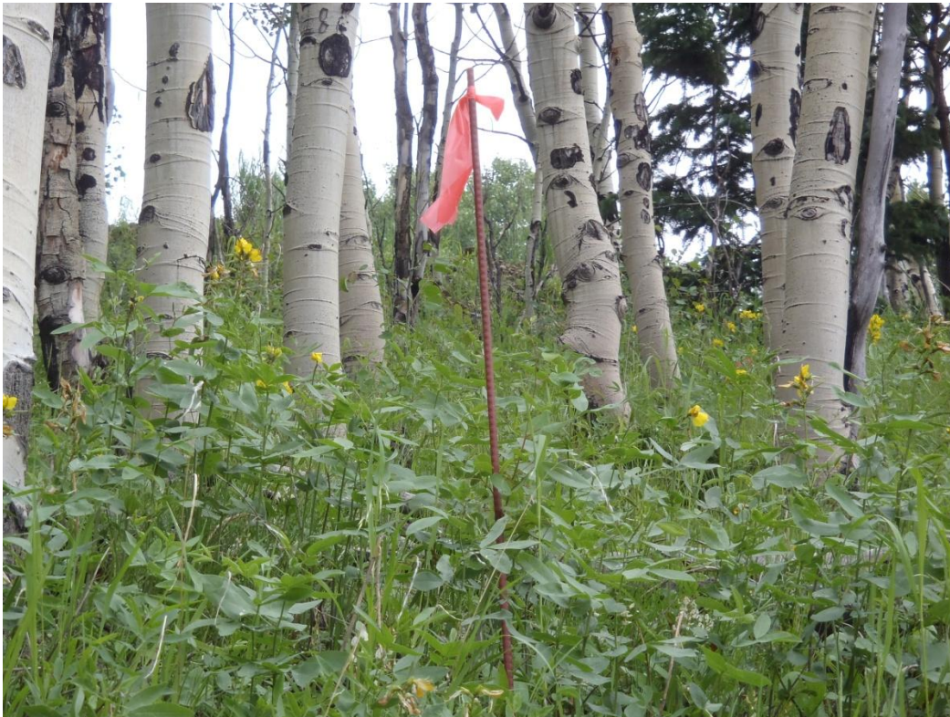
Photo 2. Typical permit boundary marker.