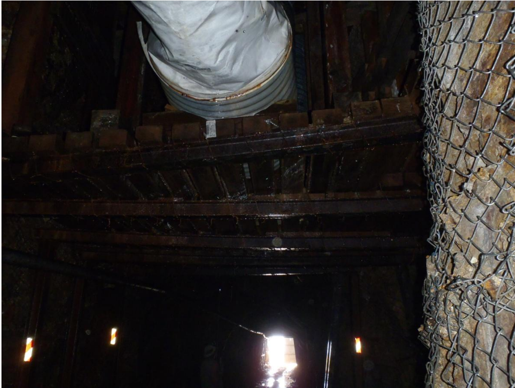
Photo 6. Water dripping from escapeway/vent inside adit (looking towards entrance).

Lance Barker Mineral Mountain Gold, LLC P.O. Box 247 Cripple Creek, CO 80813