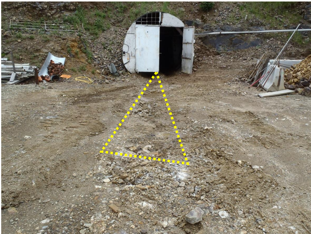
Photo 5. Observed evidence of drainage from the adit (looking SE). Note: this was determined NOT to be mine drainage