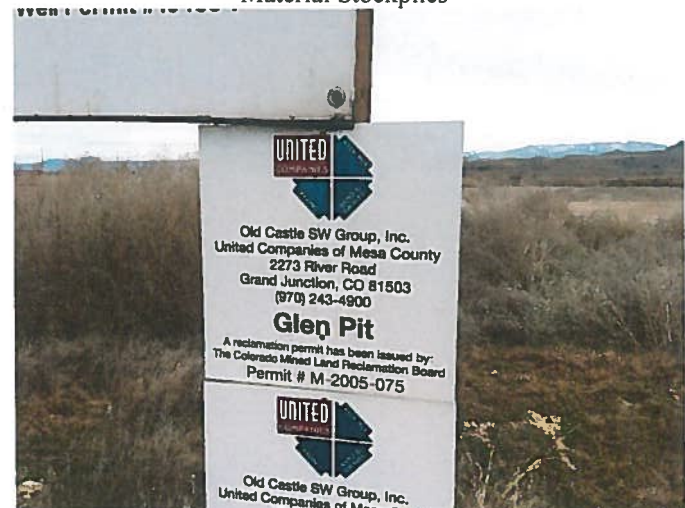
Mine ID Sign