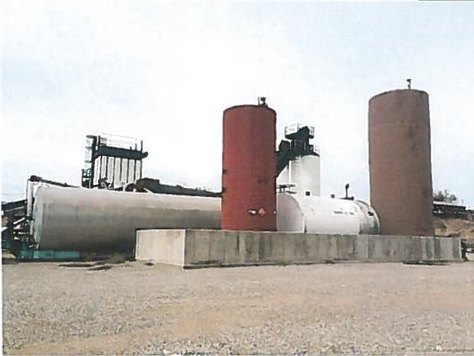
Asphalt Plant & Fuel Storage