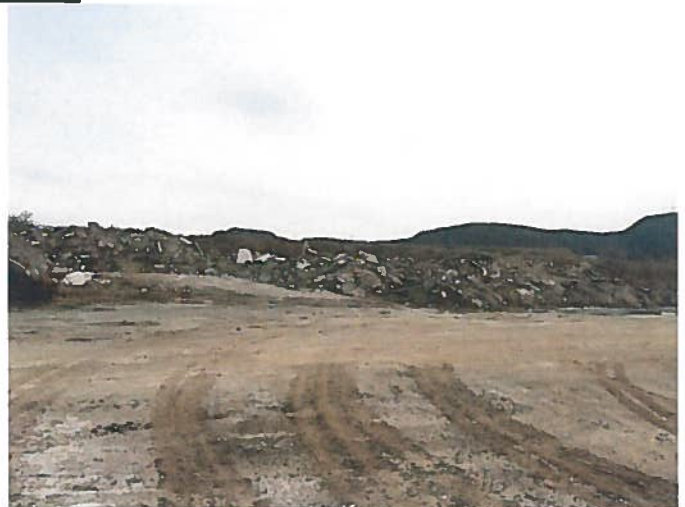
Recycled Material Area