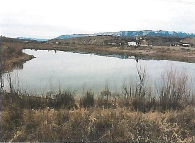
Tamarisk on shore of pond