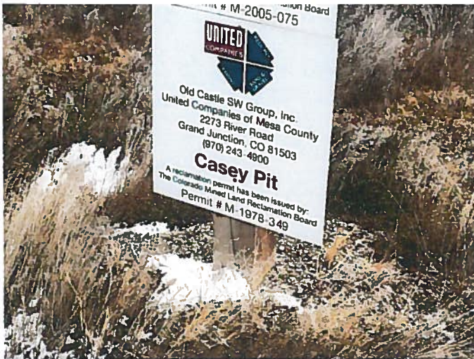
Mine Identification Sign