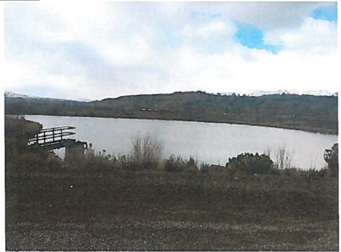
Pond with 3:1 Slopes