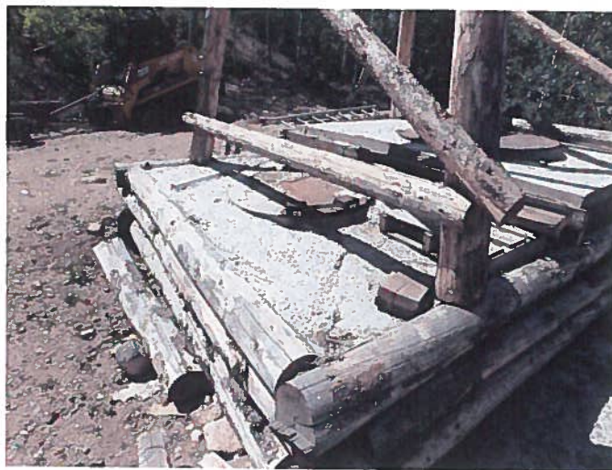
Figure 2: Smuggler Shaft