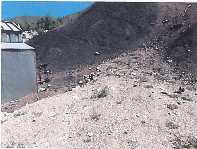
Figure 3: Tunnel No. 1A