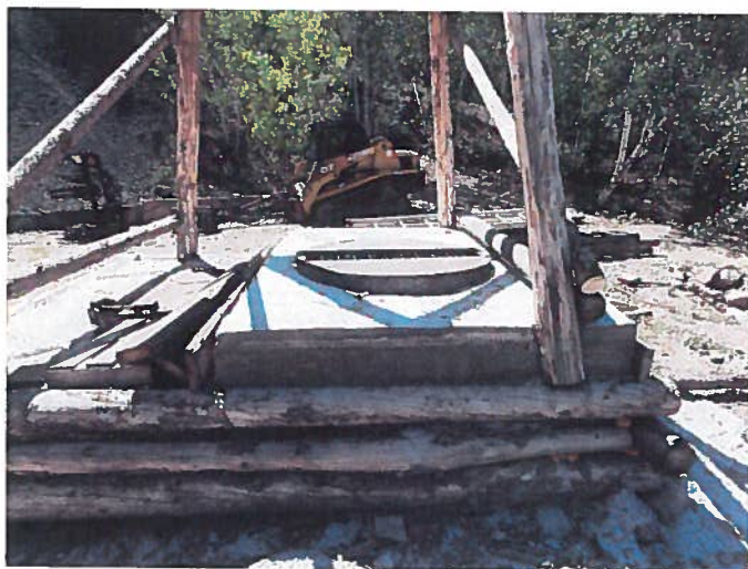
Figure 1: Smuggler Shaft