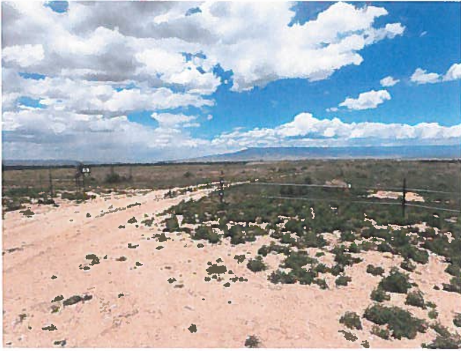
Figure 1: Reclamation area