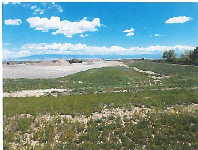
Figure 5: Active mining area