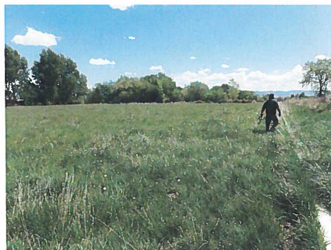
Figure 16: AM-1 Phase 3

Norm David Montrose County 161 S Townsend Ave Montrose, CO 81401