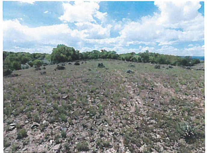
Figure 8: AM-1 Phase 1