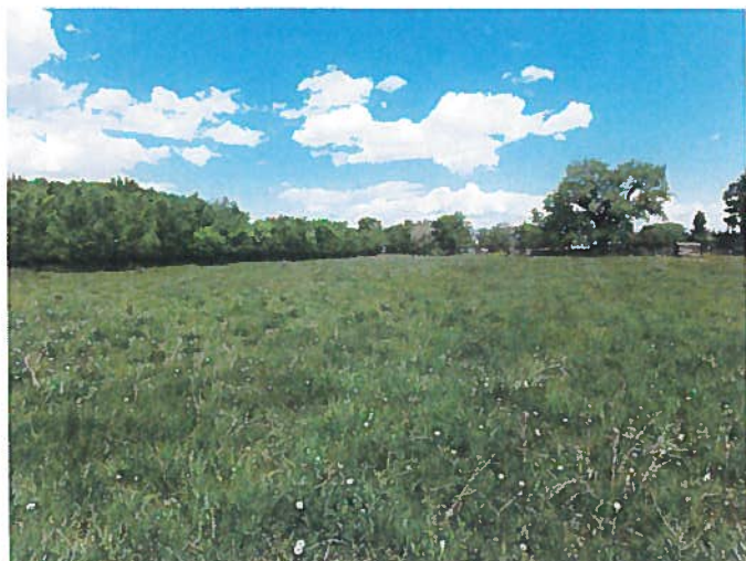
Figure 14: AM-1 Phase 3