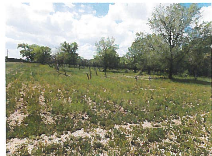
Figure 12: AM-1 Phase 2