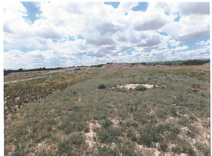
Figure 4: Reclamation area