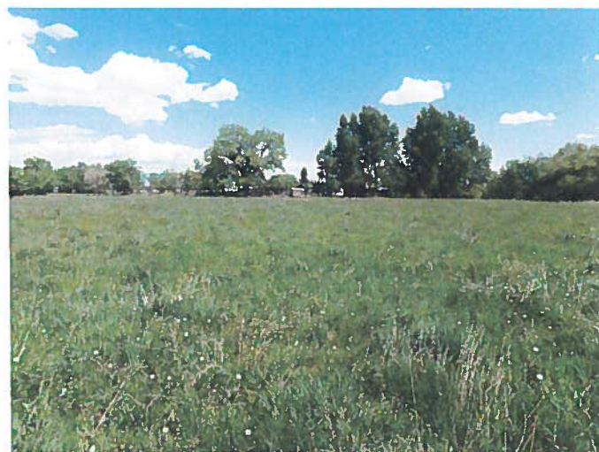
Figure 15: AM-1 Phase 3