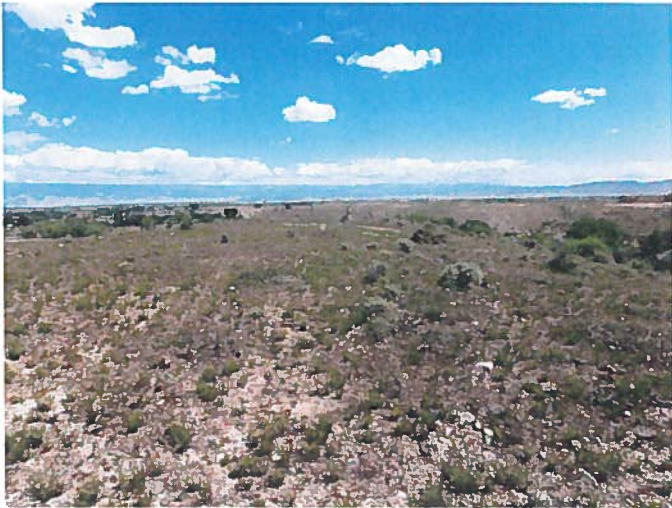
Figure 7: AM-1 Phase 1