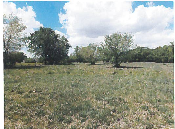
Figure 10: AM-1 Phase 1