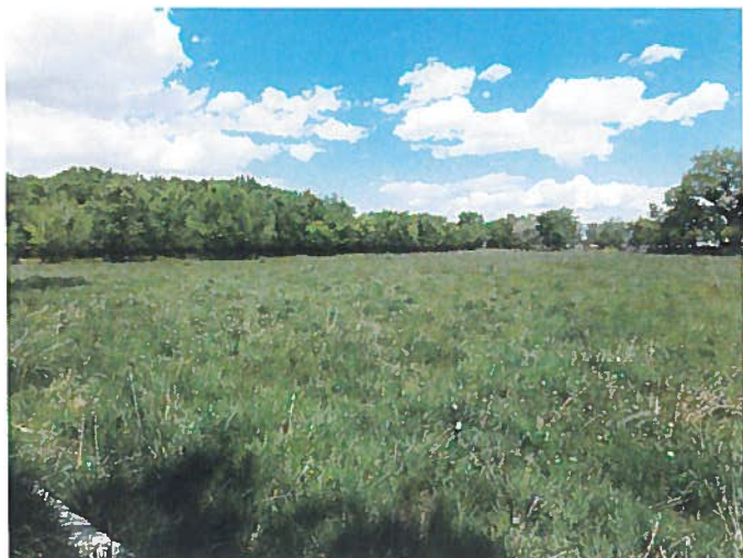
Figure 13: AM-1 Phase 3