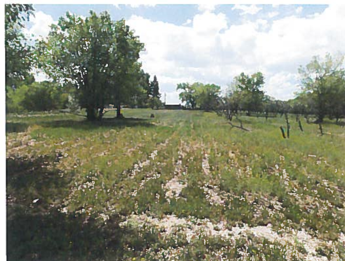
Figure 11: AM-1 Phase 2