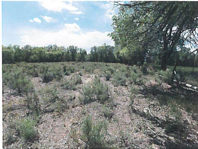
Figure 9: AM-1 Phase 1