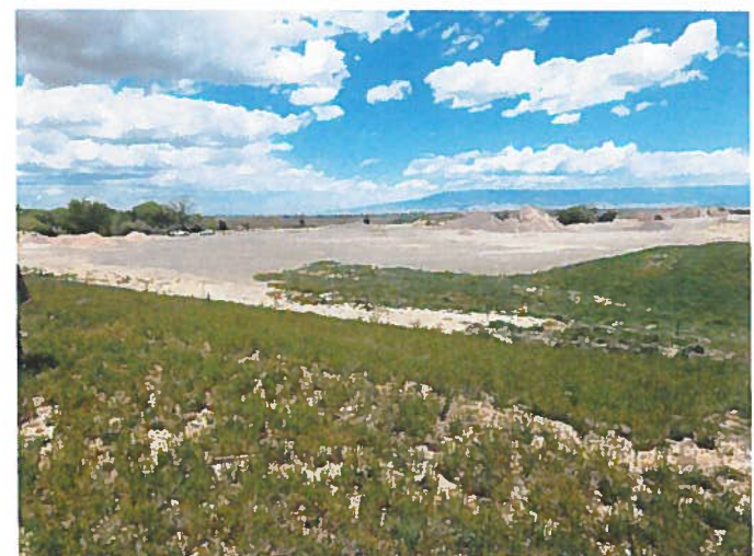
Figure 6: Active mining area