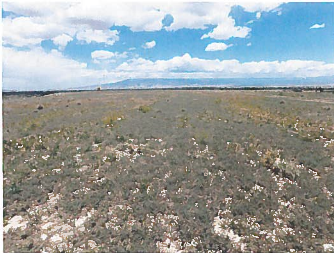
Figure 3: Reclamation area