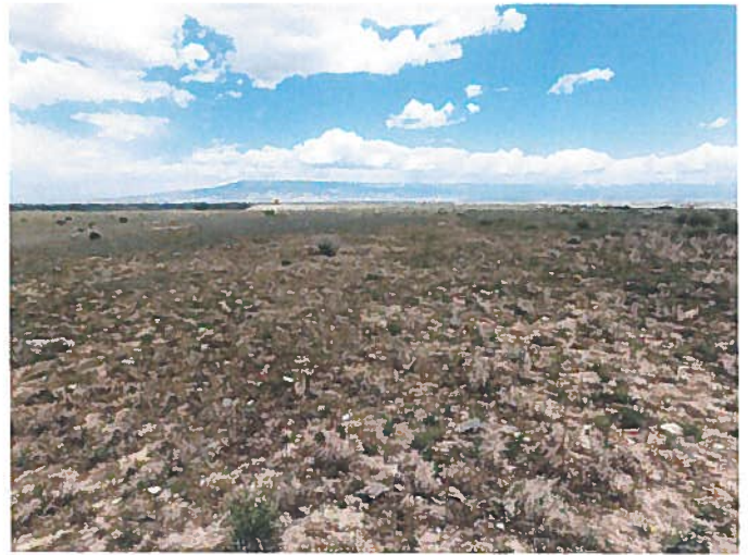
Figure 2: Reclamation area