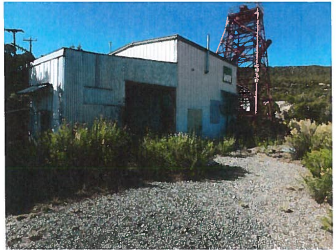
Figure 2: Hoist house