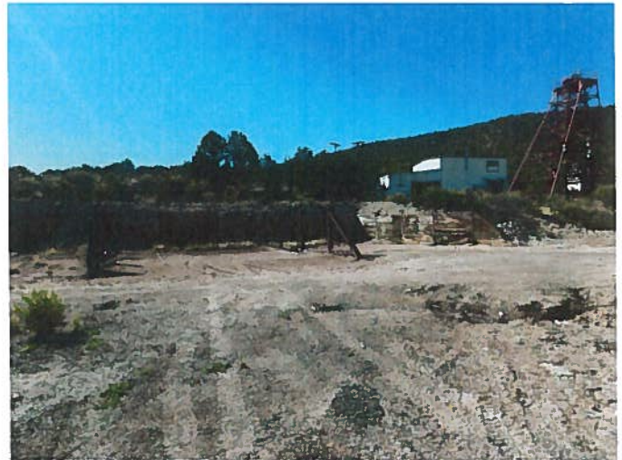
Figure 4: Ore pad