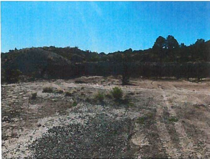
Figure 3: Ore pad