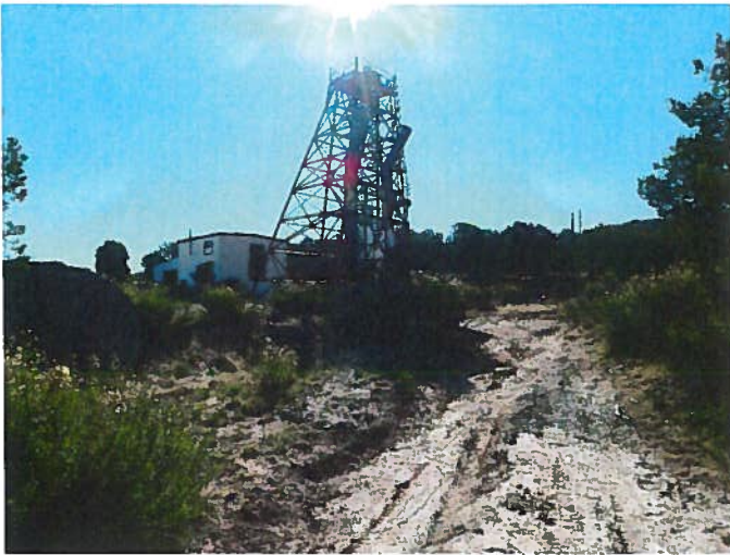
Figure 1: Primary shaft and hoist