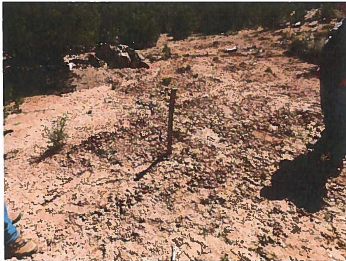
Figure 1: CM-25 drill hole

Responses to this inspection report should be directed to Dustin Czapla at the Division of Reclamation, Mining and Safety, Grand Junction Field Office, 101 South 3 rd Street, Room 301, Grand Junction, Colorado 81501, phone number (970) 243-6299.