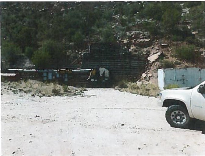
Figure 1: JD-8 portal