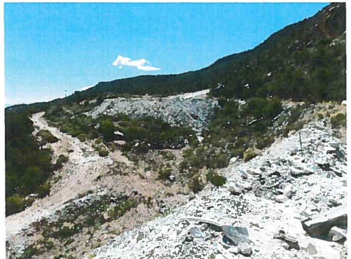
Figure 4: Sediment retention pond and waste rock dump on east side of mine bench