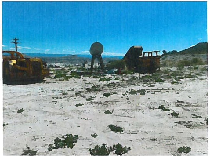
Figure 2: Operations area on mine bench