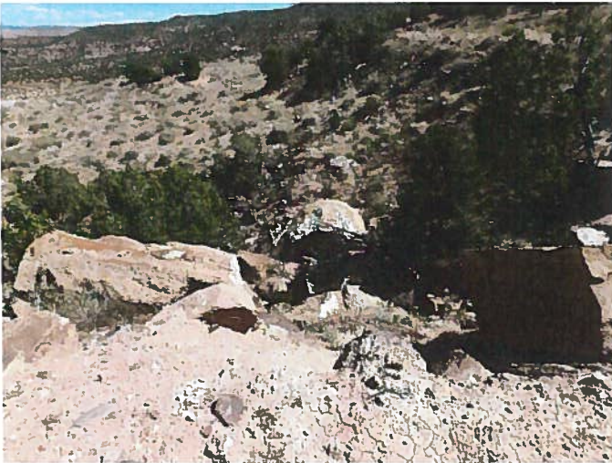
Figure 1: Looking east toward portal and waste dump.