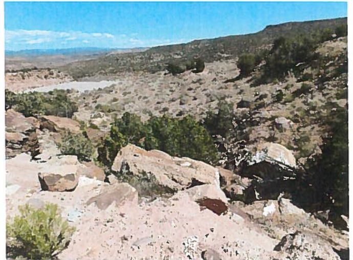
Figure 2: Looking east toward portal and waste dump.