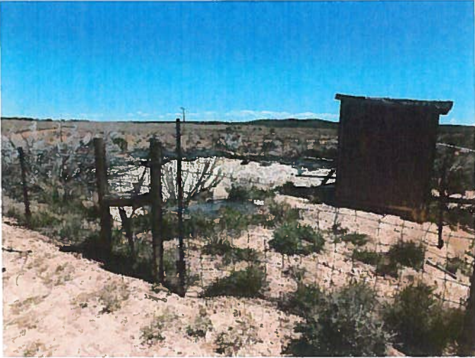
Figure 7: Water treatment area

Jim Sheridan Cotter Corporation P.O. Box 700 Nucla, CO 81424