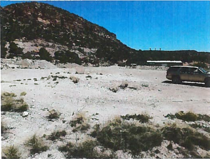
Figure 3: Mine bench