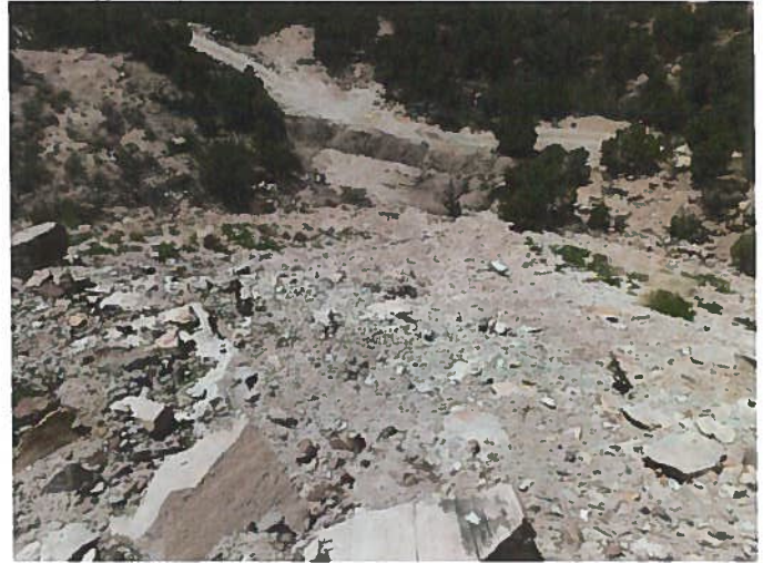
Figure 4: Retention pond