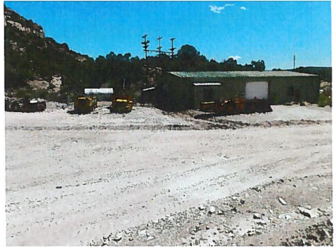
Figure 2: Shop area