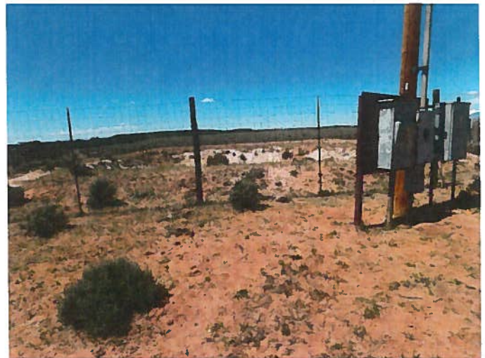
Figure 6: Water treatment area