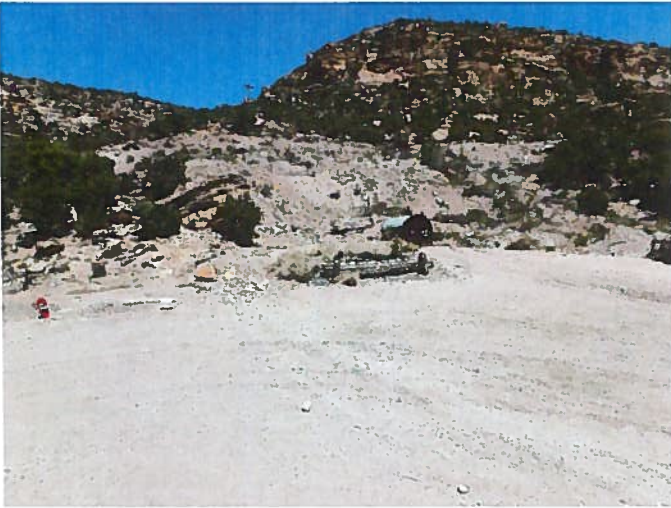
Figure 1: Collapsed portal