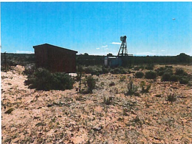
Figure 5: Water treatment area