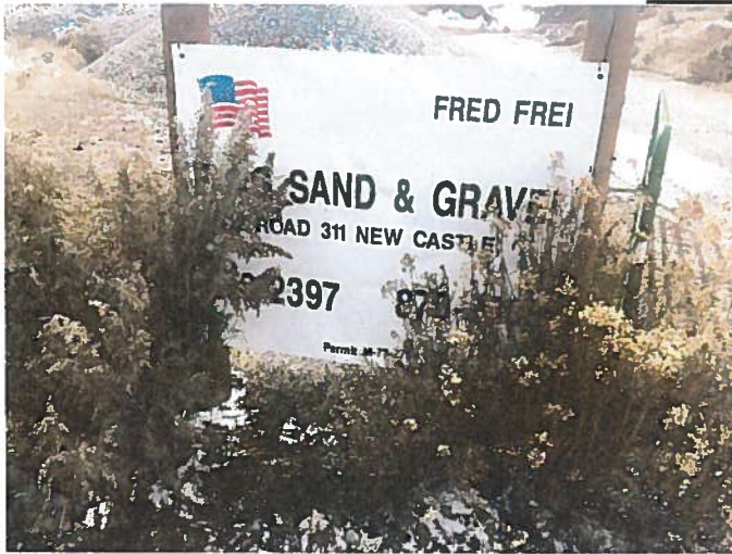
Mine Identification Sign