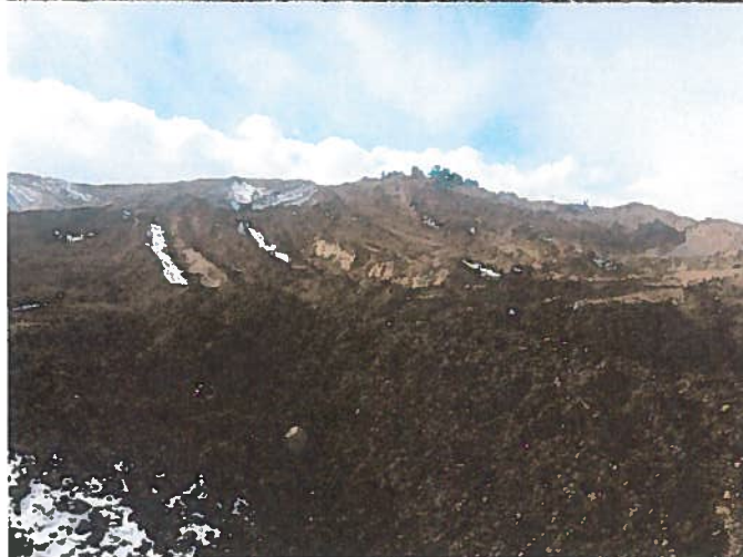
Reclamation initiated with topsoil cover