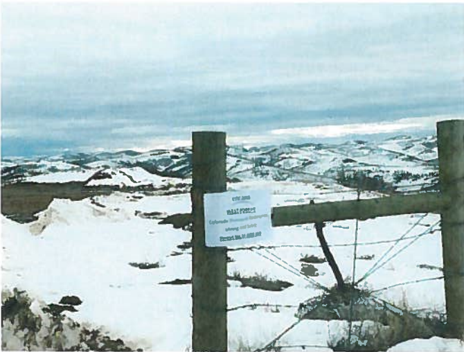
Mine Identification Sign