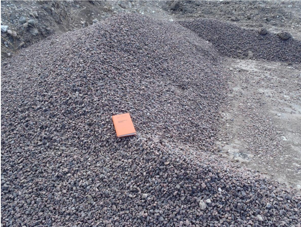
Photo 4. Blasting stem material stockpile.

The following list identifies the environmental and permit parameters inspected and gives a categorical evaluation of each