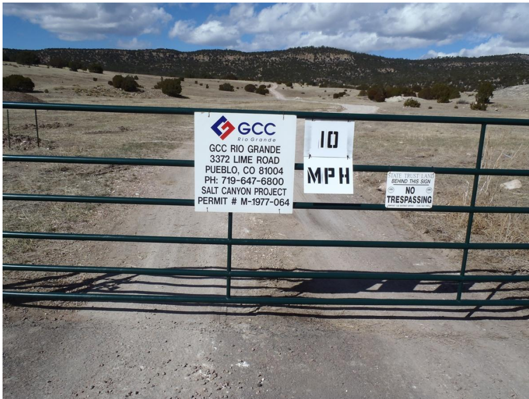
Photo 1. Permit identification sign.