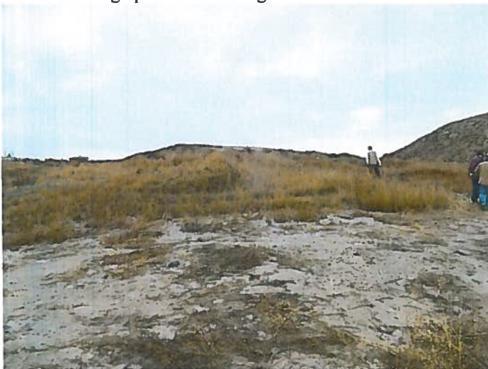
Topsoil stockpile with adequate vegetation