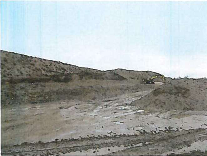
Excavator removing overburden