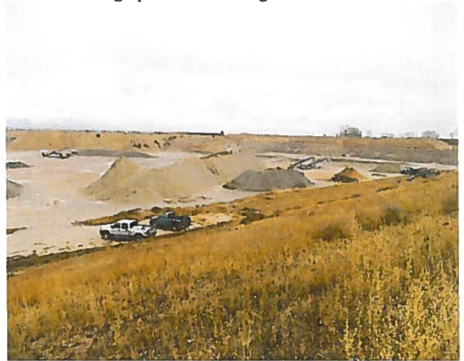
Mining operations looking northeast