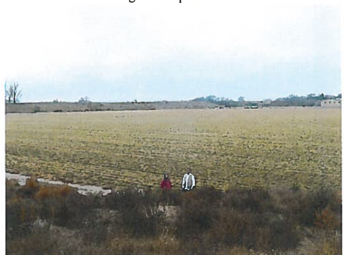
Reclaimed irrigated cropland