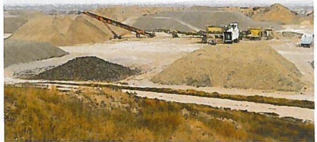
Mining operations looking north