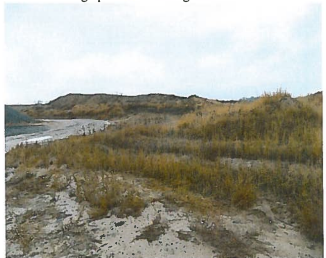
Topsoil stockpile with adequate vegetation