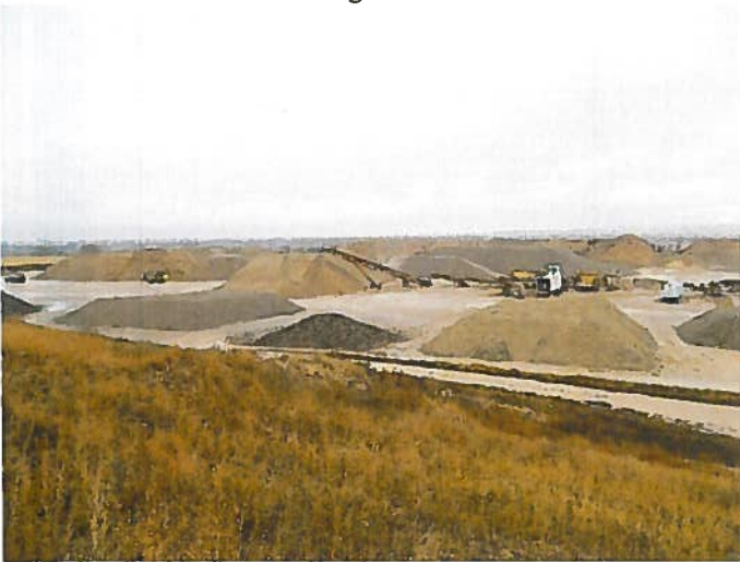
Mining operations looking northwest