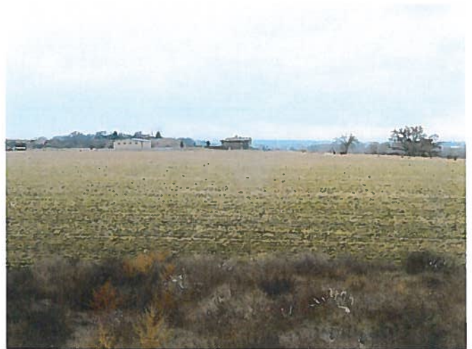
Reclaimed irrigated cropland