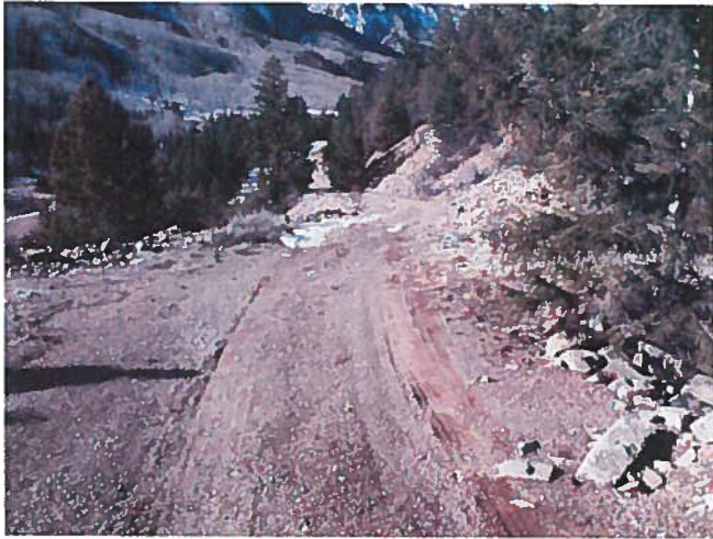
Figure 9: Proposed new access road