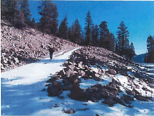
Figure 3: Reclaimed area on the private land