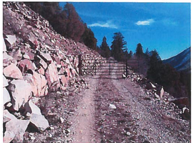
Figure 10: Proposed new access road

Frank Gutierrez The Gallegos Corporation P.O. Box 821 Vail, CO 81658