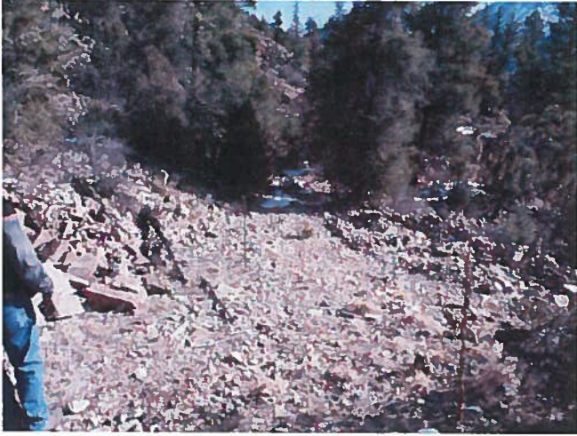
Figure 7: Proposed new access road