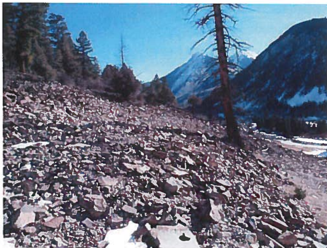
Figure 5: Reclaimed area on the private land