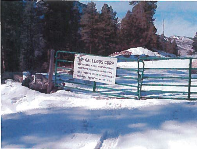
Figure 1: Permit area entrance to the private land