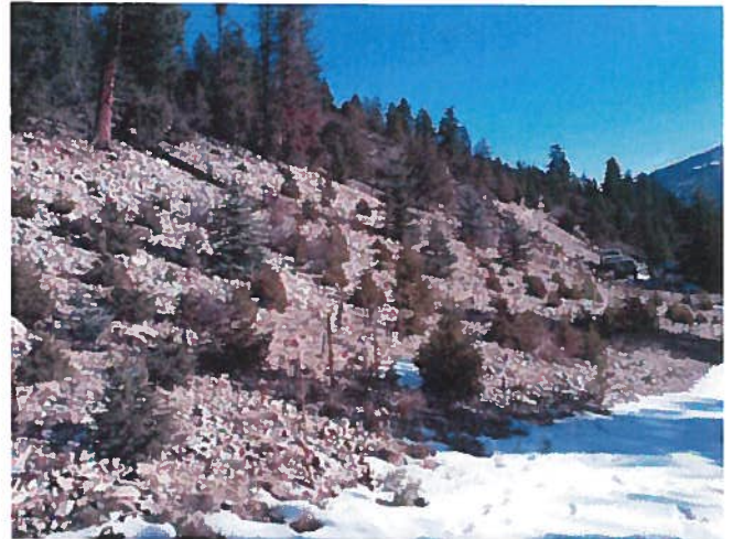
Figure 2: Reclaimed area on the private land