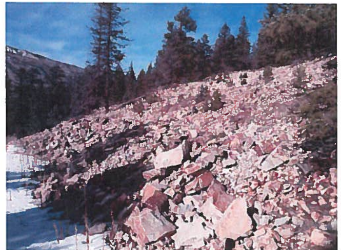
Figure 4: Reclaimed area on the private land