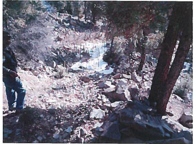
Figure 8: Proposed new access road