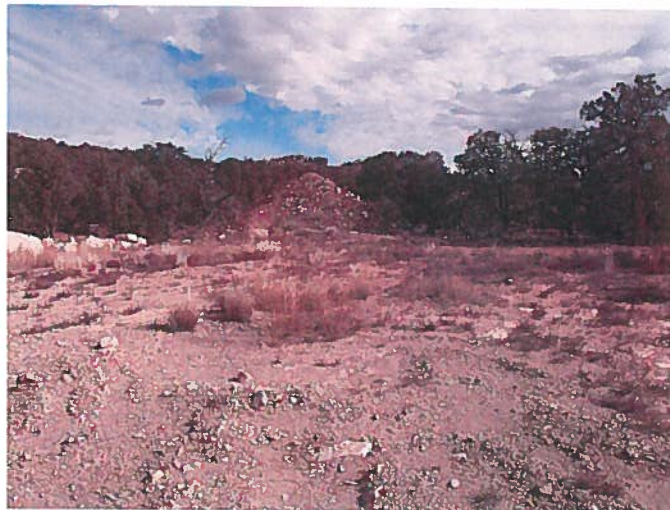
Figure 4: Soil stockpile