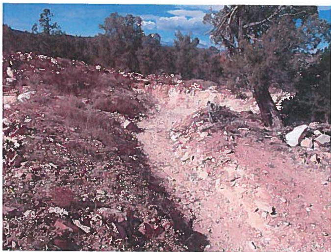
Figure 1: Pond 3