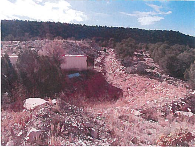
Figure 7: Constructed diversion ditch

Paul Szilagy Nuvmco, LLC P. O. Box 1120 Broomfield, CO 80038