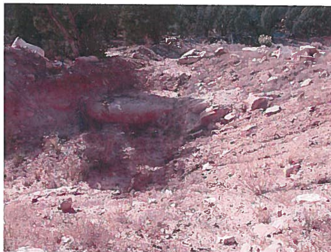
Figure 2: Pond 2