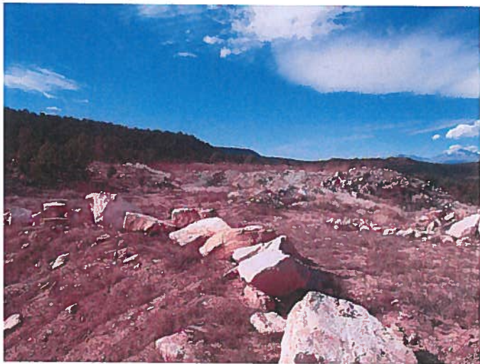
Figure 3: Waste rock area