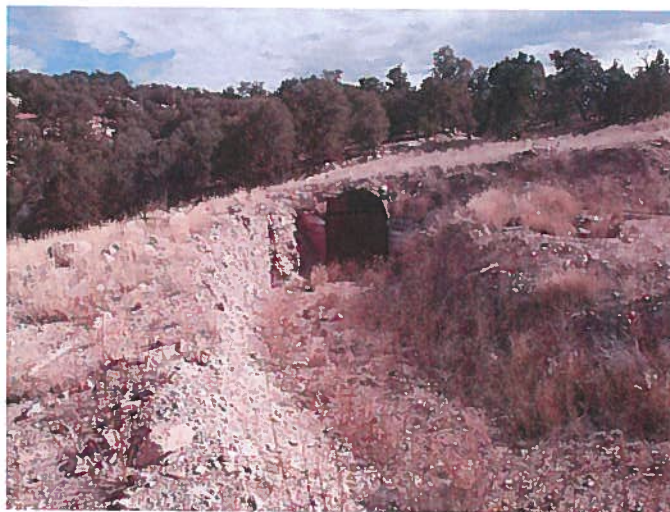
Figure 6: Mine portal