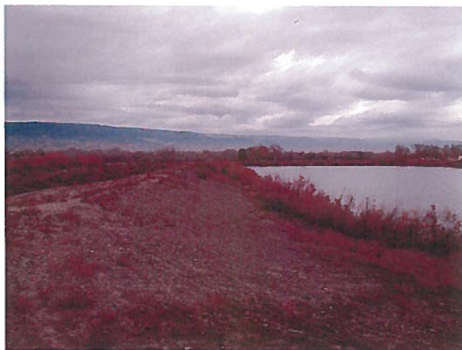
Figure 5: West bank of the southeast lake from southwest corner