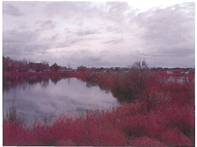
Figure 2: Northeast lake from west side