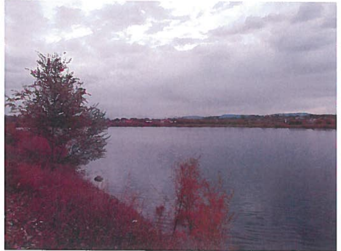
Figure 8: View from north bank of the west lake, facing east