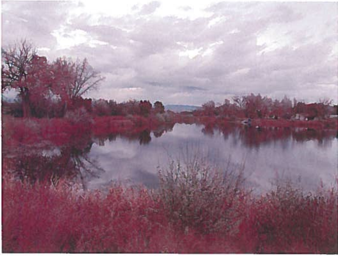
Figure 1: Northeast lake from west side