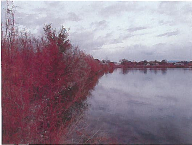
Figure 3: North bank of the southeast lake from northwest corner