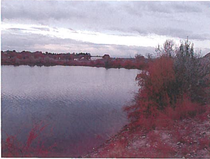
Figure 7: View from north bank of the west lake, facing west