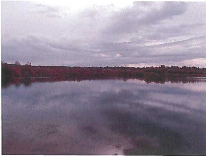
Figure 9: View from the northeast corner of the west lake, facing south