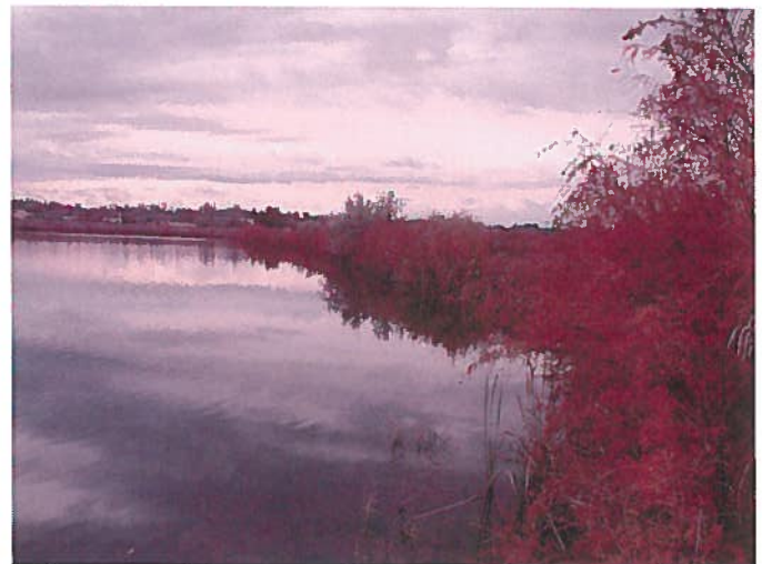
Figure 4: West bank of the southeast lake from northwest corner