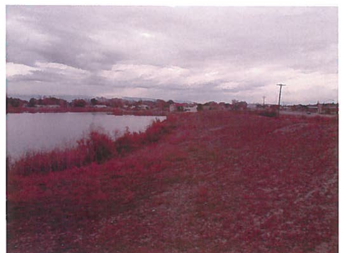
Figure 6: South bank of the southeast lake from southwest corner