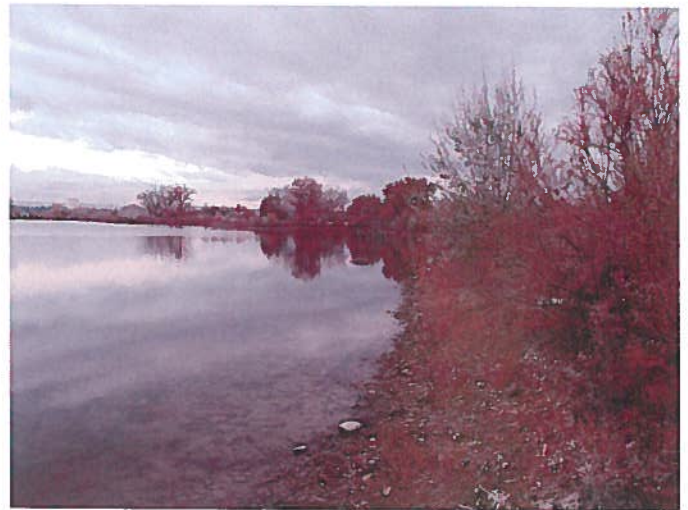
Figure 10: View from the northeast corner of the west lake, facing west