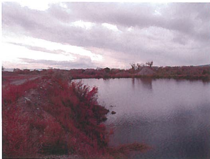
Figure 11: View from the south side of the west lake, facing west