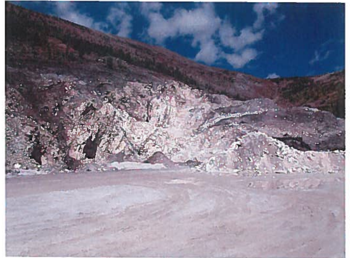
Figure 4: South highwall area