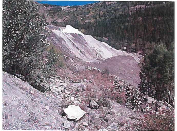
Figure 2: Reclaimed slope at foot of waste pile