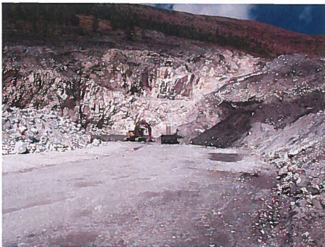
Figure 5: South highwall area