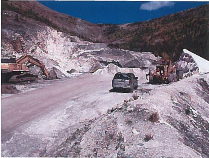
Figure 3: Mine bench and stockpile area