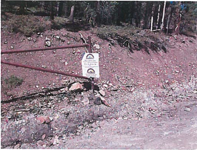
Figure 1: Mine ID sign at entrance