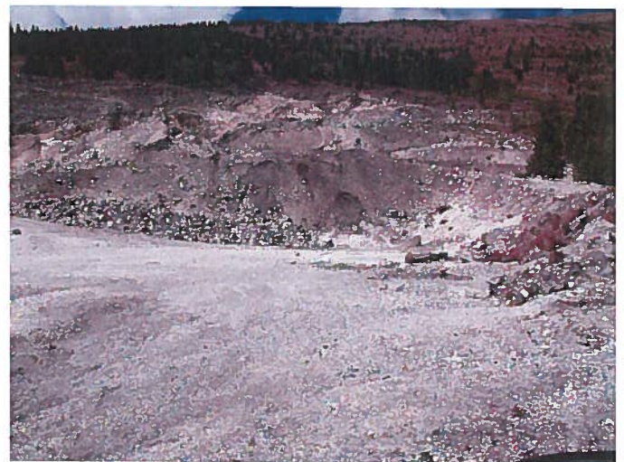
Figure 6: North highwall area