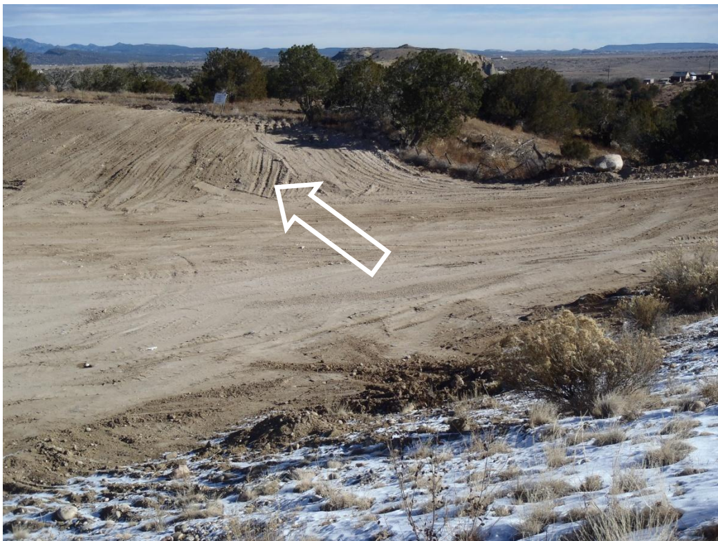
Photo 2. Recontoured east highwall (looking NE) {Note tire marks}.