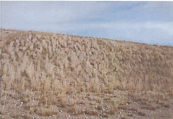
Well vegetated section of north slope