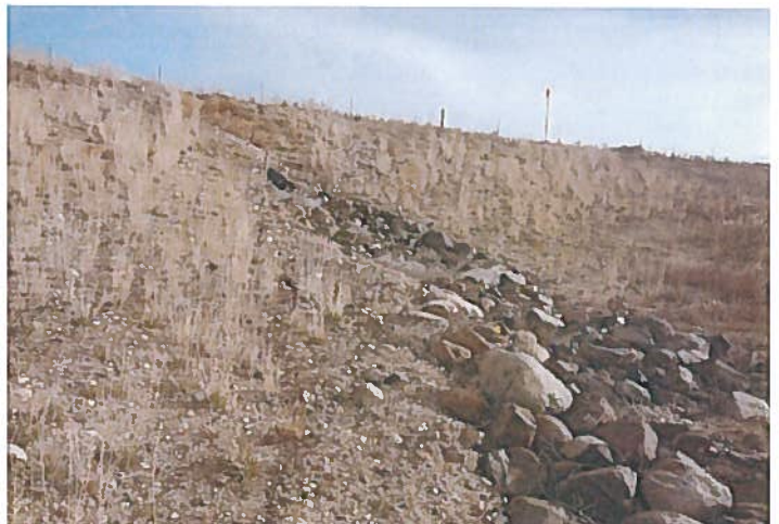
Northeast corner stormwater pipe and erosion control