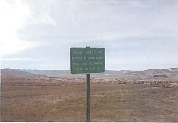
Granby Airport Pit sign