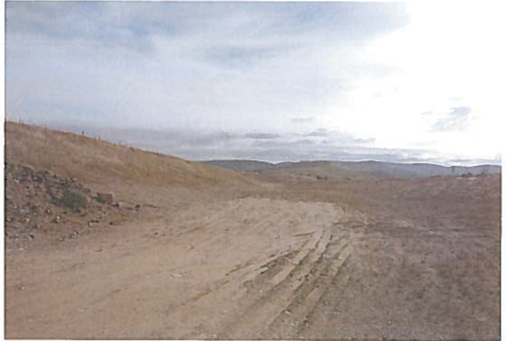
Looking east from west end of site