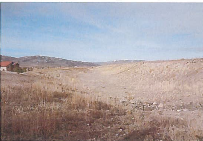
Looking west from east end of site