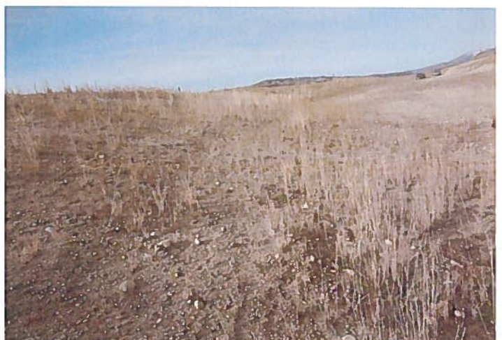
Looking at bare section of south slope