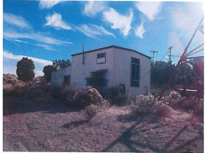
Figure 2: Hoist house