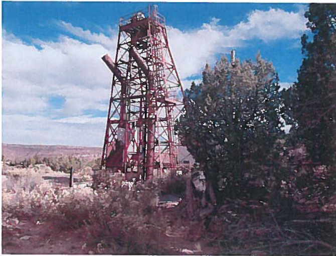
Figure 1: Primary shaft and hoist