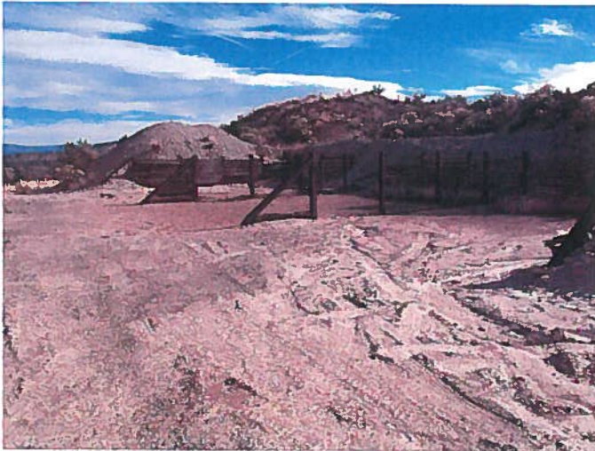
Figure 3: Ore pad