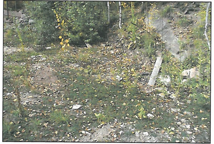
Left photo: Close-up of capped drill hole.