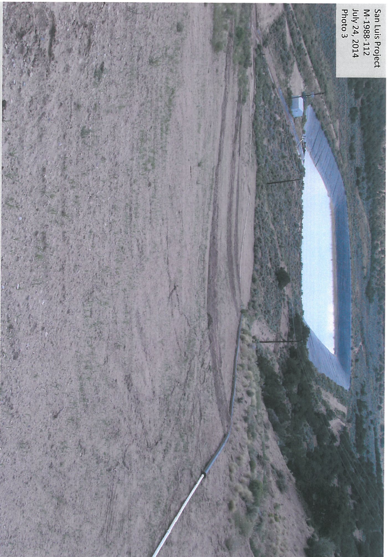
View southwest, showing portions of the north groin of the tailing pond embankment and recent repairs of minor erosion. On-site discussion included erosion control methods in addition to the construction of contour berms/ditches.

San Luis Project M-1988-112 July 24, 2014 Photo 3