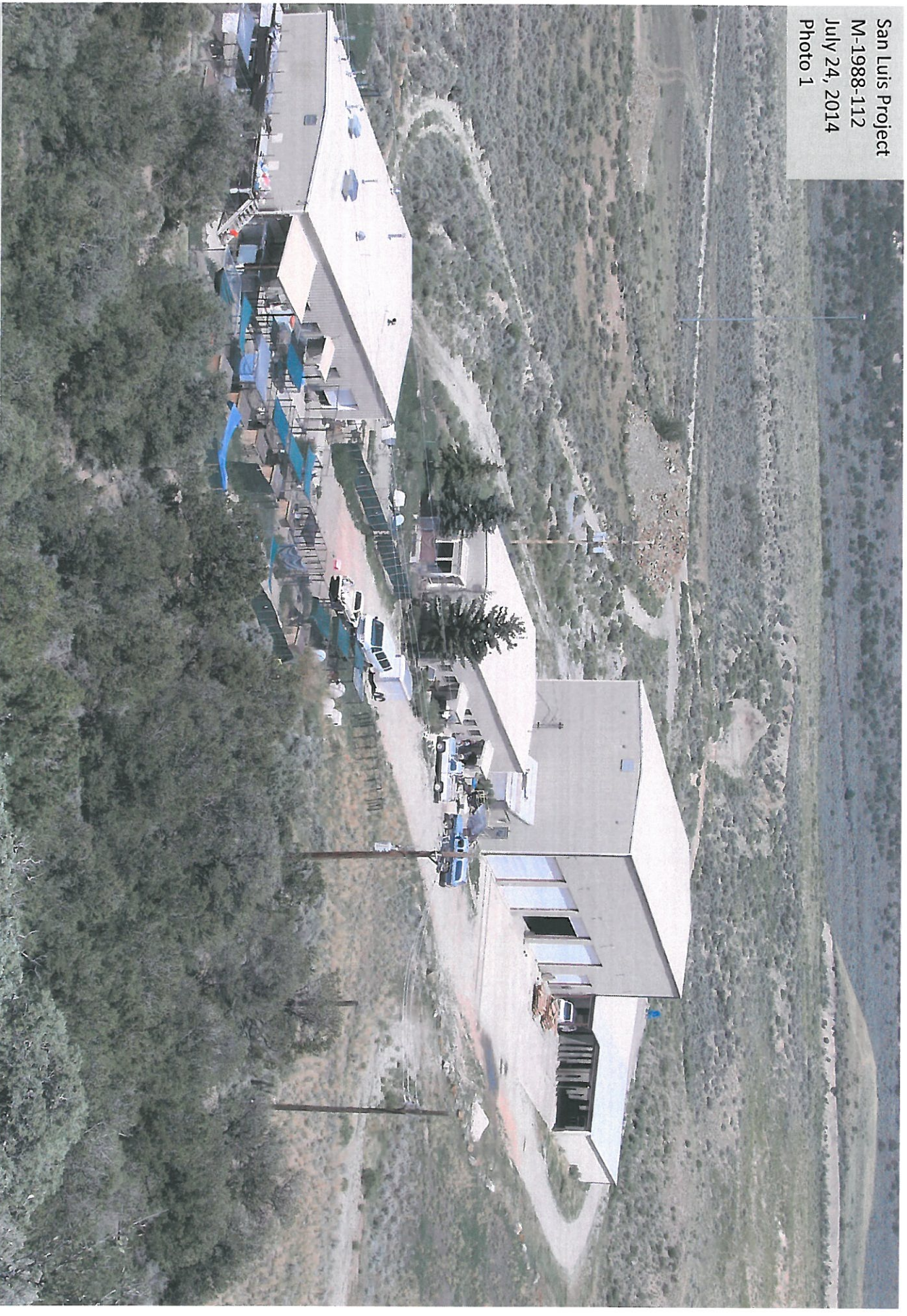
View northeast, showing portions of the property previously deeded to Costilla County and currently owned by San Luis Valley Animal Welfare Society. On-site discussions included potential release of the property from the permit area.

San Luis Project M-1988-112 July 24, 2014 Photo 1