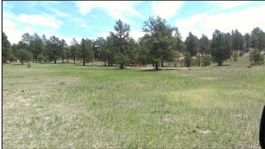
Photo 4. View looking east from access road, near center of proposed affected area.