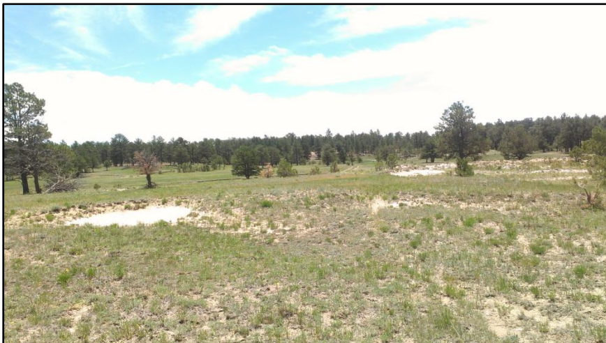
Photo 3. View looking east from western boundary of proposed affected area.