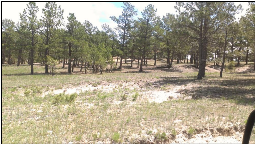
Photo 5. View looking east from access road in southern portion of permit area.