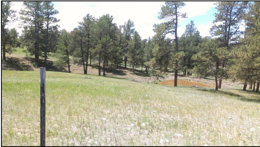
Photo 2. View of boundary marker for southeast corner of proposed affected area. Note stock pond at right, which is located within the proposed affected area.