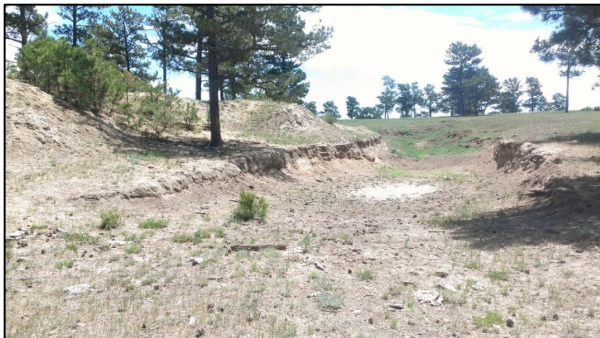
Photo 6. View of historical mining area located near access road within permit area, east of proposed affected area.