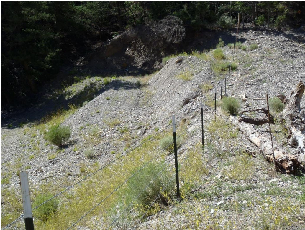
Photo 2. Fence separating area to be released, left of fence (looking east).