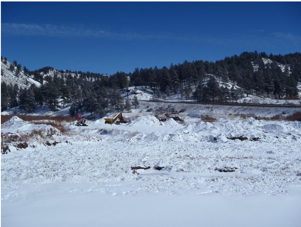
Photo 4. Mine equipment observed on site included a screen, backhoe, and loader (looking SE).