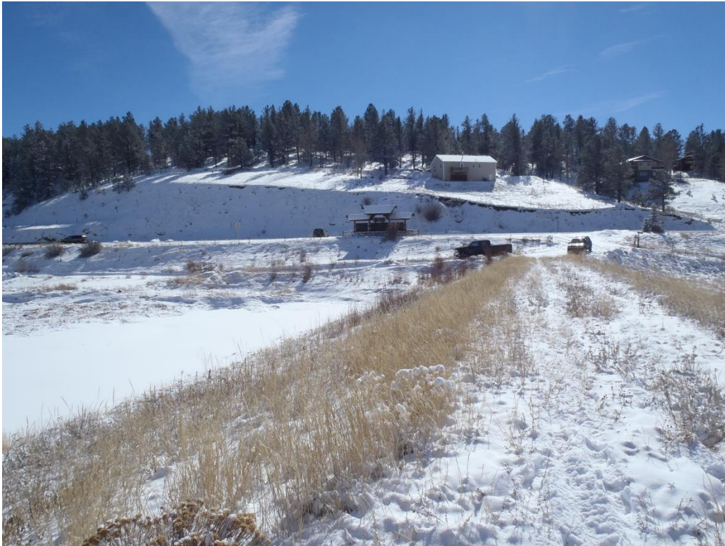
Photo 3. Short access road (east-west in background) & dam (looking south).