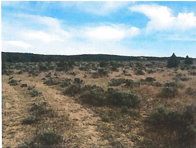
Drill Pad MBS008