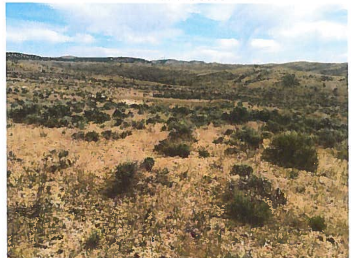
Drill Pad MBS002