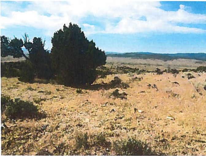
Reclaimed Drill Pad MBS003