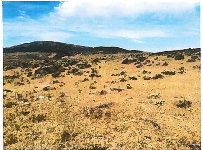
Drill Pad MBS001