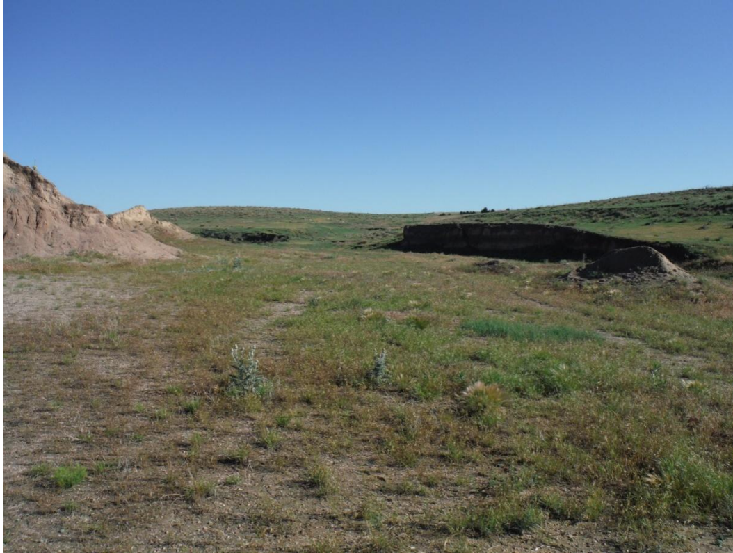
Natural cut-bank of creek near the eastern boundary line of the permit, heavy cheat grass infestation within mine site; looking north.