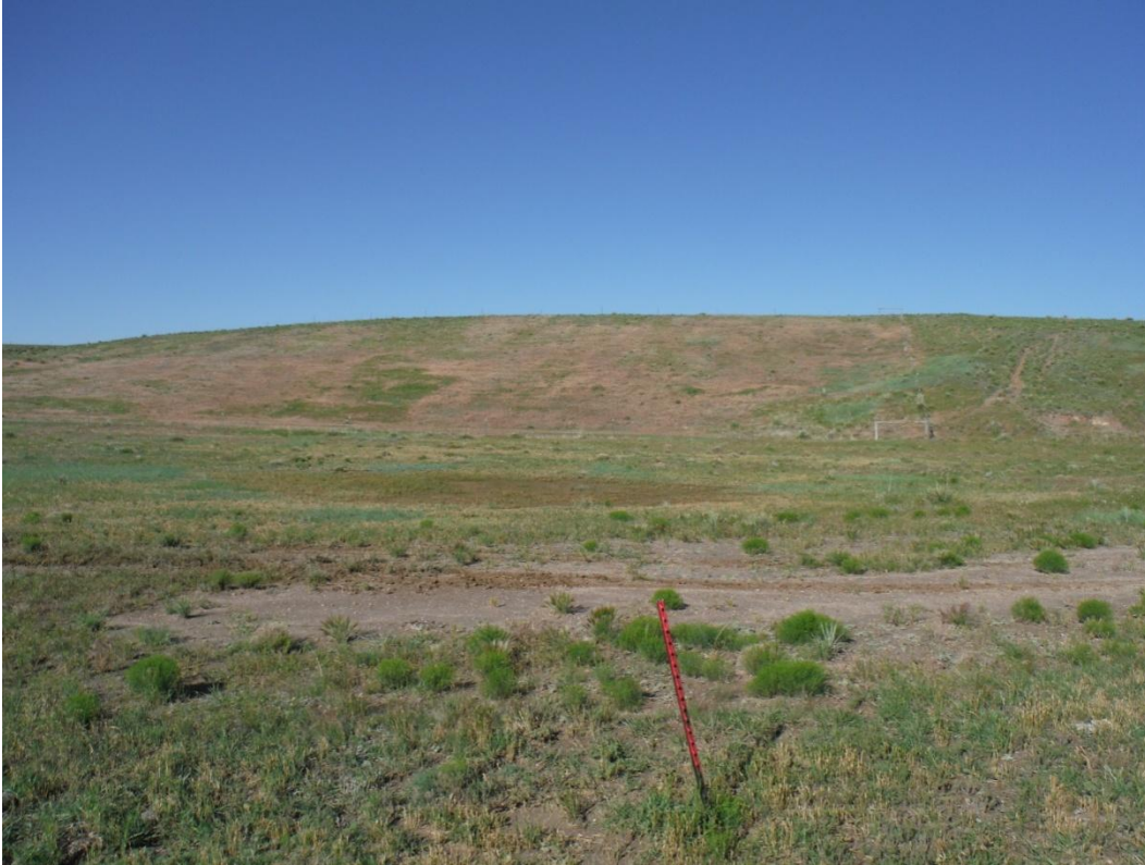
Middle area, fenced off for reclamation; looking west (eastern boundary line marker in foreground).