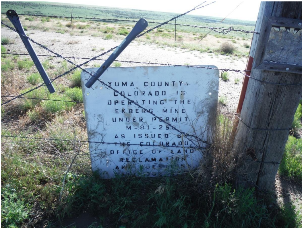
Mine site identification sign; looking east.