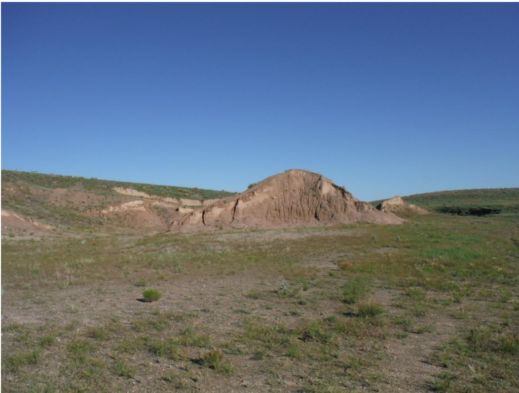
Material stockpile in northern area; looking north.