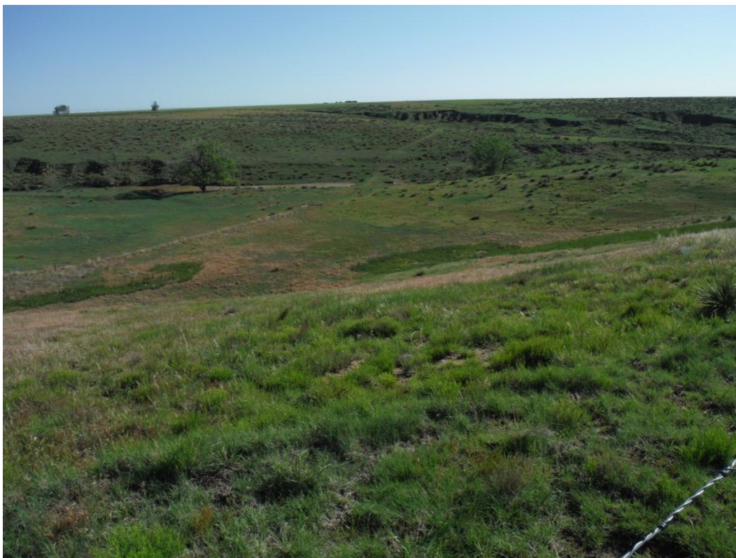
Southern most area, fenced off for reclamation; looking northeast.